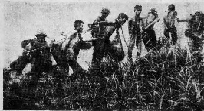
Mass arrestation of civilians

From the end of 1954, violating article 14c of the Geneva Agreements, arbitrary arrests were carried out, individual and collective massacres were perpetrated on a large scale. Victims included former resistance members which means almost the entire South Vietnamese people. Even within the first year of the signing of the Geneva Agreements, their number reached tens of thousands. The names of Ngan Son, Duy Xuyen, Huong Dien, Cho Duoc, are among those unfortunately notorious throughout the country as scenes of most shocking carnage. In the affair of Duy Xuyen (Quang Nam province) on January 21, 1955, the executioners rounded up 116 persons, picked out 47 of them for disembowelling, gouging out their eyes, cutting off their tongues and ears before pouring petrol over them and setting it alight, throwing the remains into the Vinh Trinh dam. At Cho Duoc (Quang Nam province) on November 28, 1955 they buried alive 21 persons. These are only a few examples among thousands of others equally horrible.