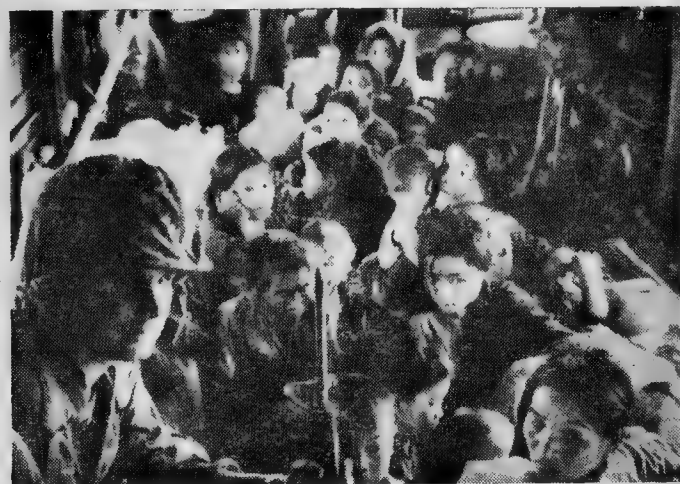
U.S. aggressors herded the inhabitants in the southern part of the demilitarized zone into helicopters and lifted them to the concentration camps.

The massacres perpetrated against our patriots, in the minds of the American hangmen, should have intimidated the Vietnamese people by sheer terror. Apart from a handful of traitors however the South Vietnamese people continue to fight unflinchingly for independence, reunification of the country, for liberty and democracy. In order to control a hostile population, the Americans and their valets have resorted to the policy of concentrating the population, placing them under a police regime reinforced by army support.