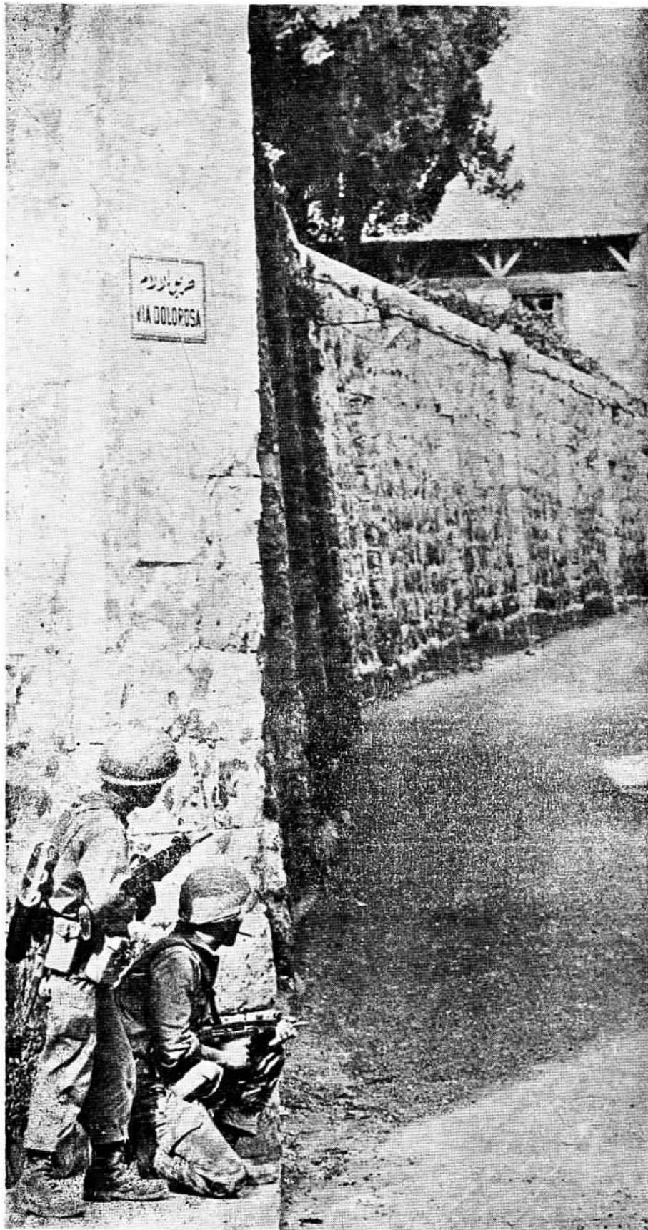
EASTER IN JERUSALEM