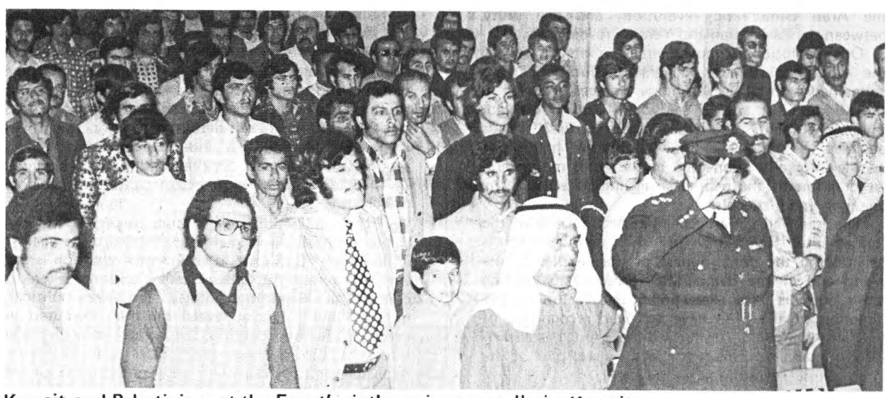
Kuwait and Palestinians at the Front's sixth anniversary rally in Kuwait

On Fabruary 28th, the Frint held a popular festival at the Kuwaiti General Labour Union. An enthusiastic crowd of some 2,500 people attended the celebration in which there was the singing of Palestinian revolutionary songs, folklors dancing, and the showing of the film «May of the Palestinians».