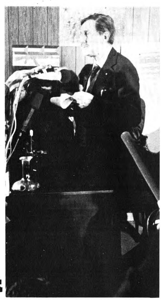
Kamal Joumblat: Kissinger s policy is based on Arab ignorance...

6) There are all out attempts to lower real petrol prices in order to increase exploitation and to help insure that the Arab example will not be followed by other countries of the Third World which possess