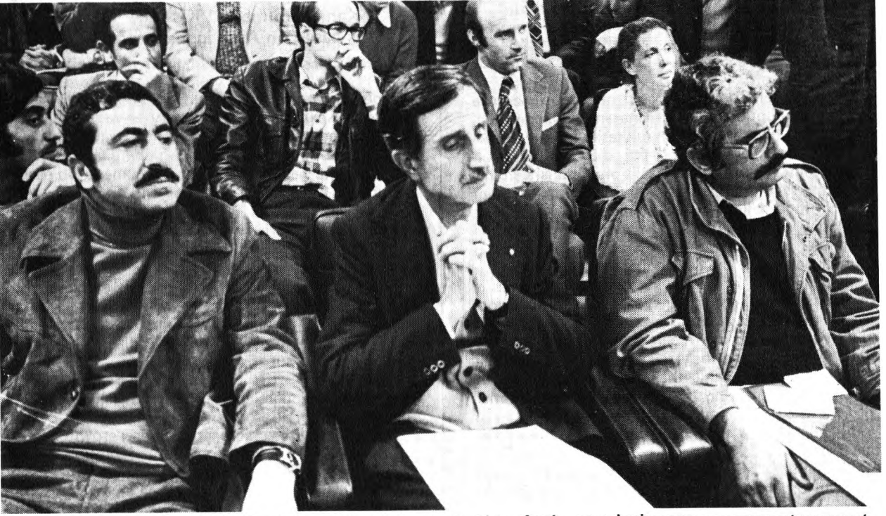
The international revolutionary movement and the Arab revolutionary movement support

Brother Mohammed Choutfi, embassador of the People's Democratic Republic of Yemen.