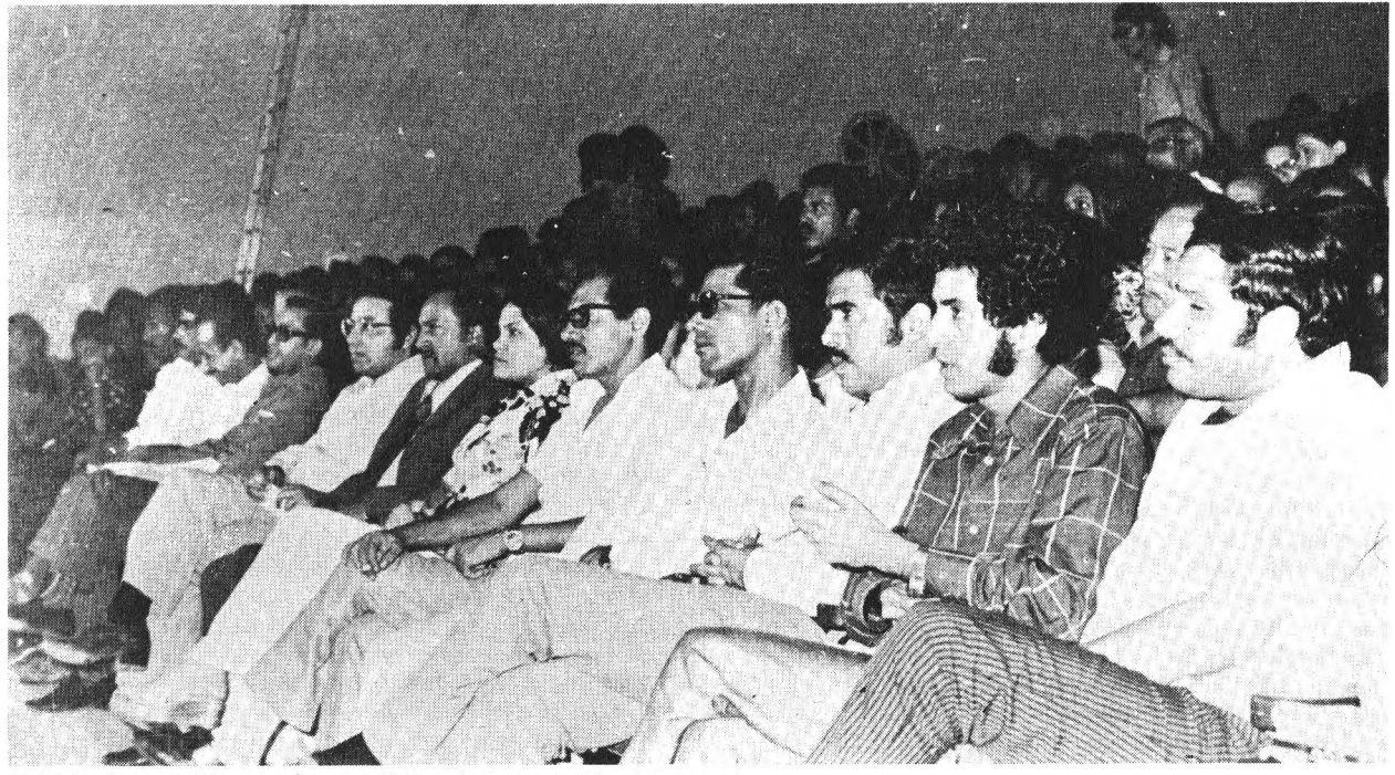
Solidarity of Yemeni and Palestinian revolutionaries.

The rally closed with the projection of Palestinian revolutionary films, and Palestinian and Yemeni folklore dances and songs.