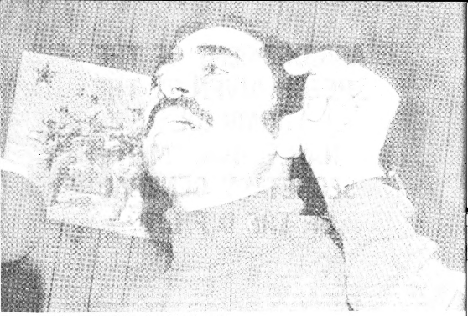
Nayef Hawatmeh: Foiling of partial settlements. We are armed with our guns and our political program. The mass mobilization, indicator of a correct political line.

executes its plans» we say, even after the 1967 defeat the enemy was unable to effect the liquidationist, surrenderist solutions. Our recent victories make this present state one in which we are more solidly than ever able to combat the conspiracies against us.