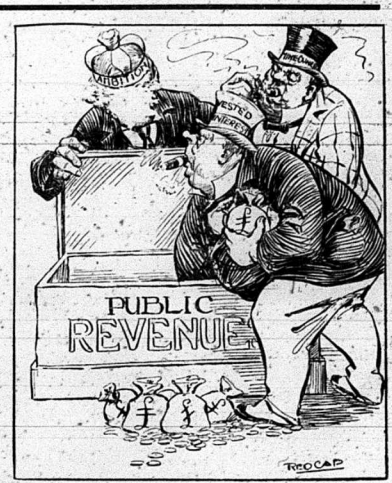
YES, WE WANT NO COMPETITION

"Then Forward Christian Soldiers." and "Thank God from Whom All Blessings Flow." was sung. Whispered: "God Save the King."—AND LOUDLY CHANTED. "THE SOLDIER'S SONG."