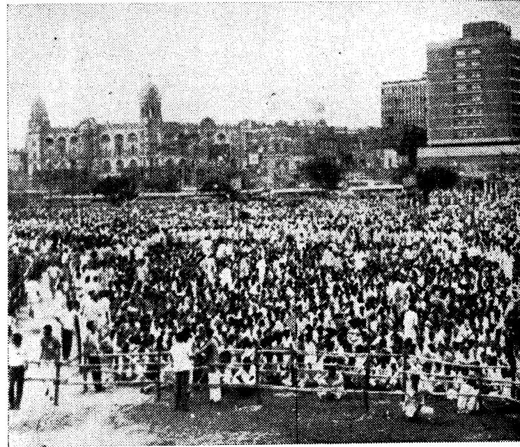
General Secretary Comrade Shibdas Ghosh (inset r

The national liberation in Bangladesh bears a tremendous significance so far as the Indian politics is concerned. While elaborately dealing with the question, how a modern nation develops and the specific historical conditions which led to the emergence of Pakistan as a nation, Com. Ghosh said that in the shaping out of Pakistan nationalism it was confronted with two obstacles. The first, was the attitude of the West Pakistan ruling clique to look upon East Bengal as a colony—exploiting the people there economically, politically, socially and culturally like the imperialists and the second, is the absence of any geographical contiguity between the two wings of Pakistan. As a result of the two factors, Pakistan nationalism failed to develop as one integrated nationalism. Historically a new nation has emerged in Bangladesh born out of a secular democratic outlook and fighting against