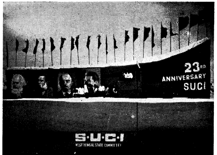
The dias decorated with pictures of Marx, Engels, Lenin and Stalin and 23 Flags atop

After that Com. Subodh Banerjee moved the main resolution expressing deep concern at the sweeping victory of the Congress (R) in the last mid-term poll and a resolution on Bangla Desh, hailing the heroic struggle of the freedom fighters there and both these resolutions were adopted unanimously.