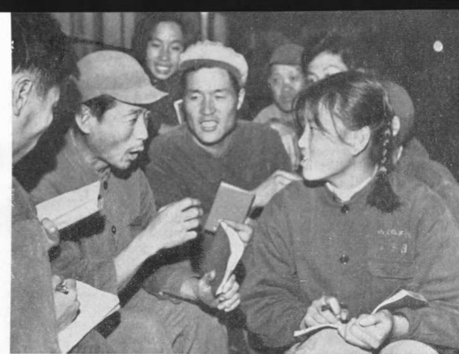
Workers at the Tsingtao No. 2 Rubber Plant are eager to give their ideas on the transformation of education to revolutionary students and teachers from the Shantung Institute of Chemical Industry who have come to solicit them.

In some schools teachers and students followed Chairman Mao's admonition for "intellectuals to go among the masses, to go to factories and villages", and went to live and work with the workers and peasants. They joined them in denouncing and criticizing the revisionist line in education, made investigations and discussed tenta-