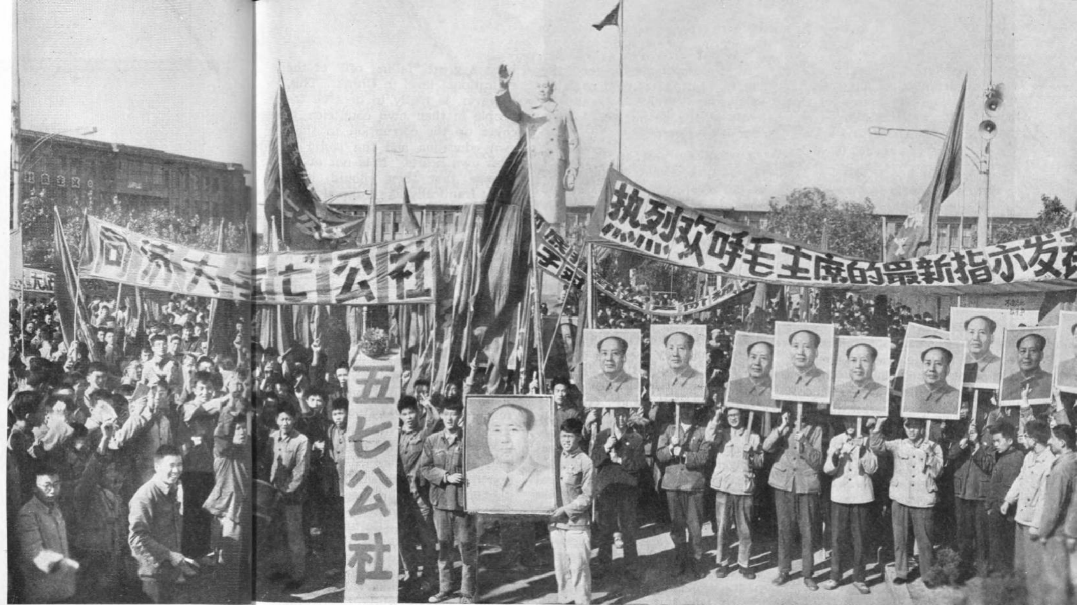
Cheering revolutionary teachers and students of Shanghai University in Shanghai pledge to carry out Chairman Mao's latest instruction on the proletarian revolution in education.

T HE proletarian revolution in education should be carried out by relying on the mass of revolutionary students, teachers and workers in the schools, by relying on the activists among them, namely, those proletarian revolutionaries who are determined to carry the great proletarian cultural revolution through to the end." Since this call from our respected and beloved great leader Chairman Mao, the revolution to smash the old educational system and clear the way for creating a proletarian educational system has been sweeping the length and breadth of the country.