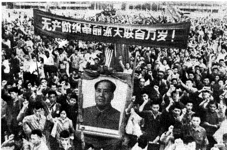
Mass rally of workers in Shanghai's Jingan District celebrating their revolutionary great alliance

With deep feelings, some miners said: Chairman Mao's instructions have infinite power. The evil bourgeois reactionary line split us, but Chairman Mao's revolutionary line enables us to unite again like members of one family.