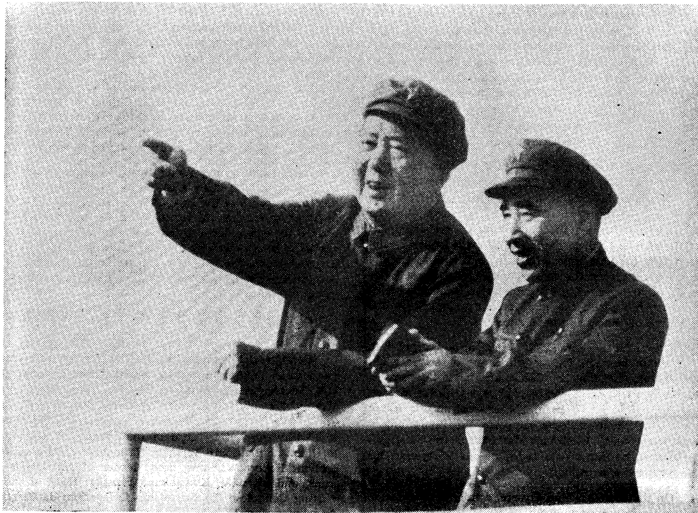
Our great teacher, great leader, great supreme commander and great helmsman Chairman Mao with Comrade Lin Piao, his close comrade-in-arms, reviewing revolutionary students and teachers and young Red Guard fighters from the rostrum of the Tien An Men gate

Pi-wu, Chen Yi, Ho Lung, Tan Chen-lin, Hsu Hsiang-chien, Li Hsueh-feng, Hsieh Fu-chih, Liu Ning-I, Hsiao Hua, Yang Cheng-wu, Chiang Ching, Liu Chih-chien, Chang Chun-chiao and Wu Teh mounted the reviewing stand on the Tien An Men gate. At that moment the whole Tien An Men Square became a great sea of roaring red waves. Thousands upon thousands of eyes, filled with the deepest of sentiments, looked up to Chairman Mao, thousands upon thousands of arms wearing red arm bands waved shining red-covered Quotations From Chairman Mao Tse-tung , and people kept cheering "Long live Chairman Mao!" "Long, long life to Chairman Mao!"