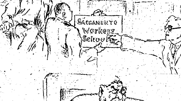
SACRAMENTO WORKERS' SCHOOL