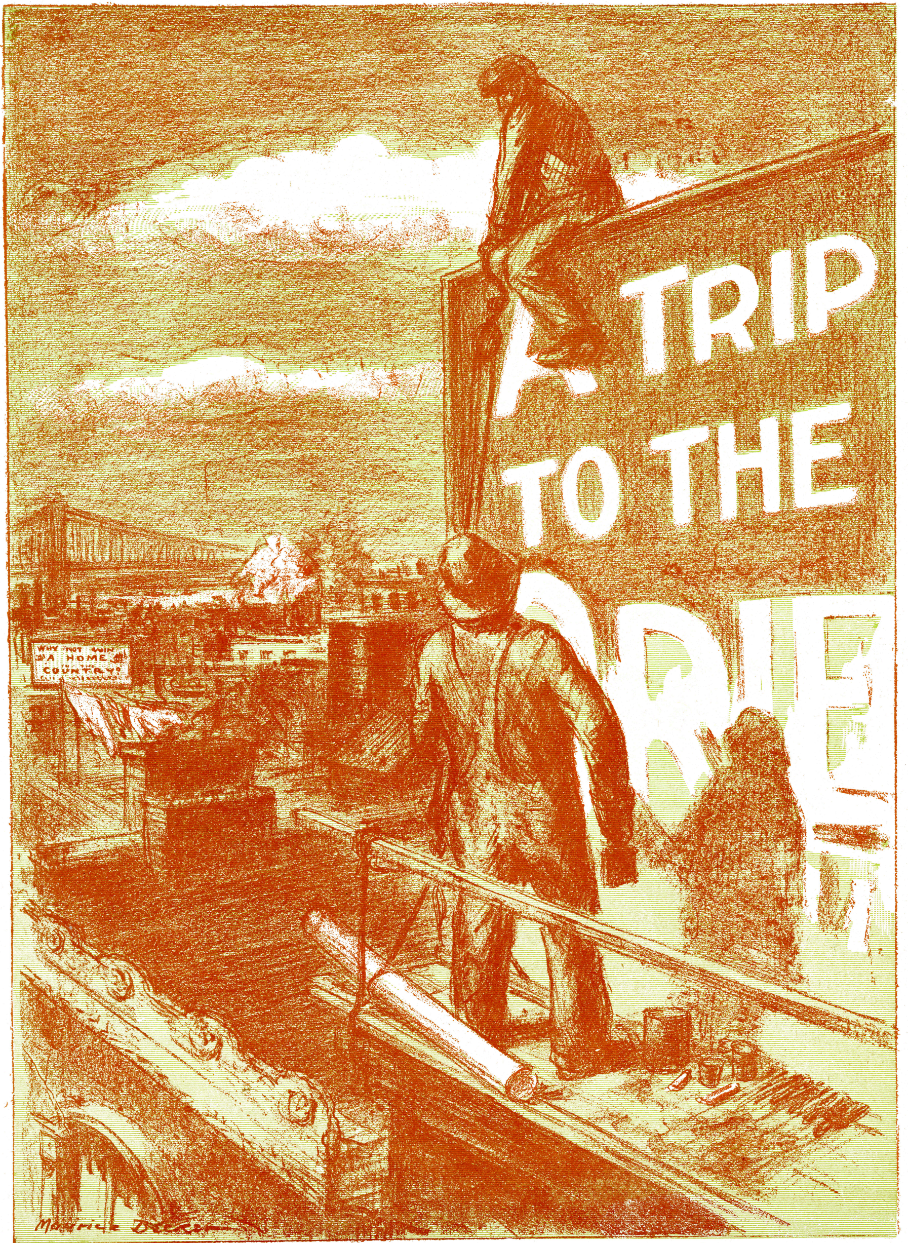
Drawn by Maurice Becker.