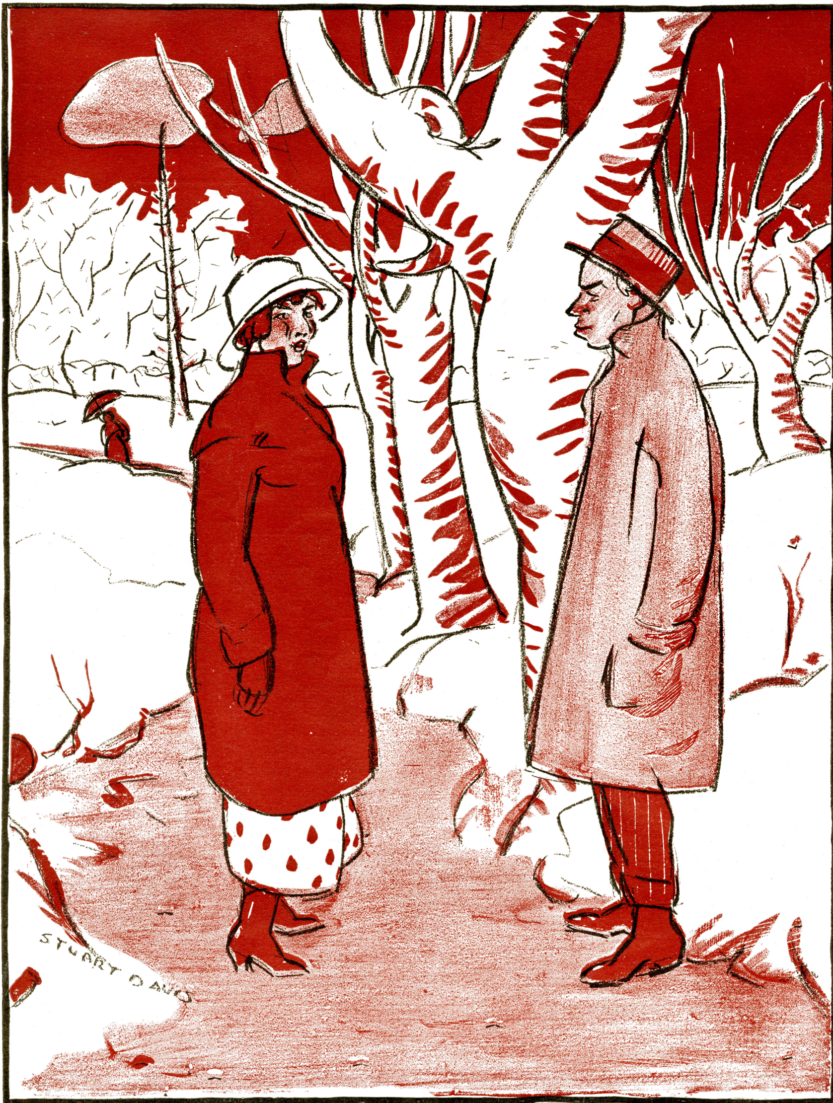
Drawn by Stuart Davis.

“Did You Find It?” “Find What?” “Spring!”