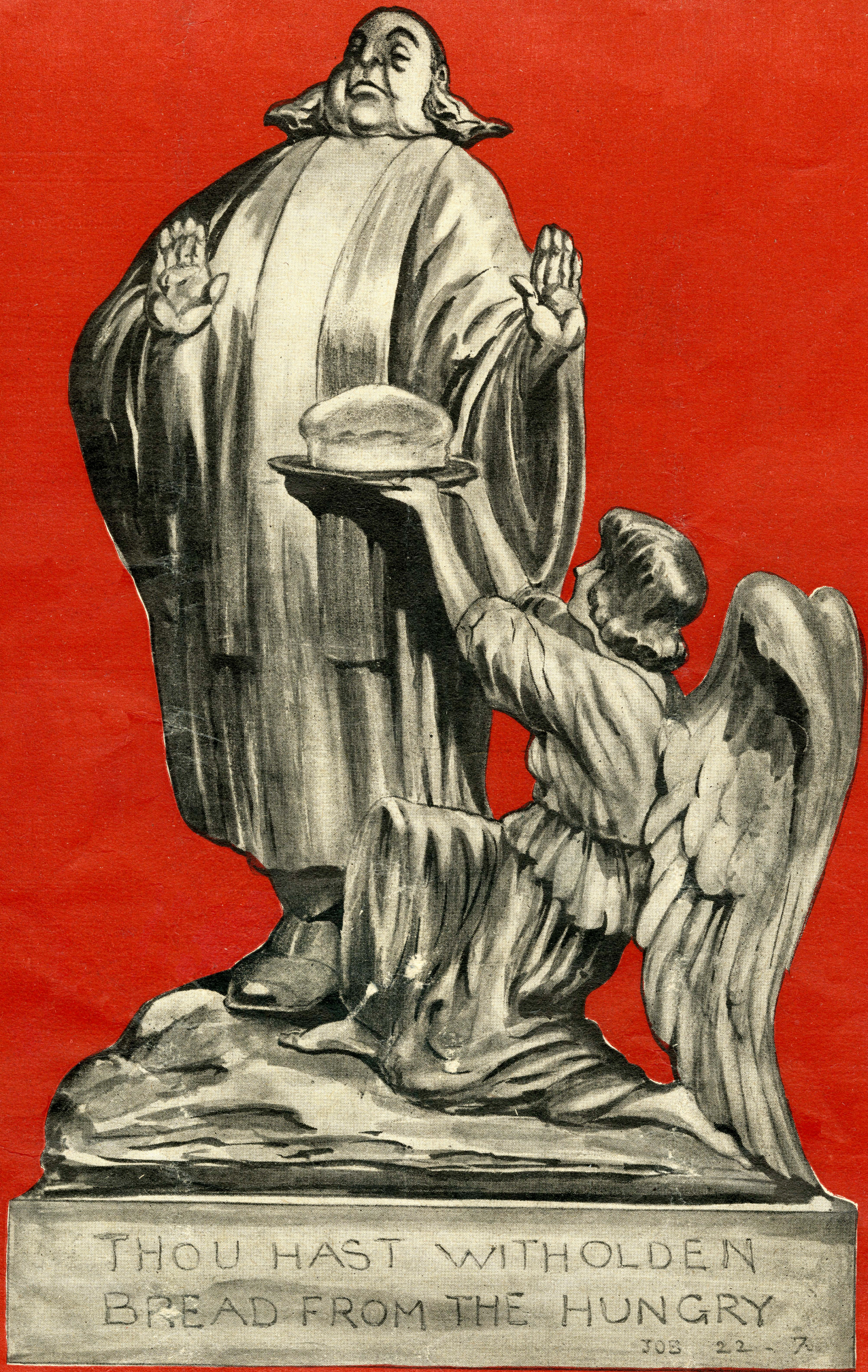
Drawn by Oliver Herford.

PROPOSED STATUE TO COMMEMORATE THE REFUSAL BY TRINITY CORPORATION OF $150,000 FOR THE DISTRIBUTION OF BREAD TO THE POOR