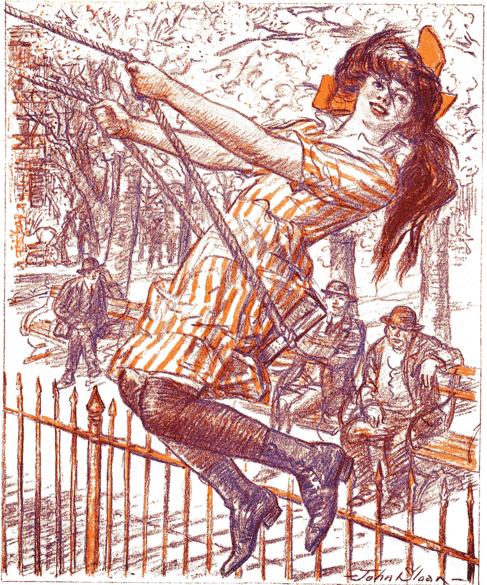
Drawn by John Sloan