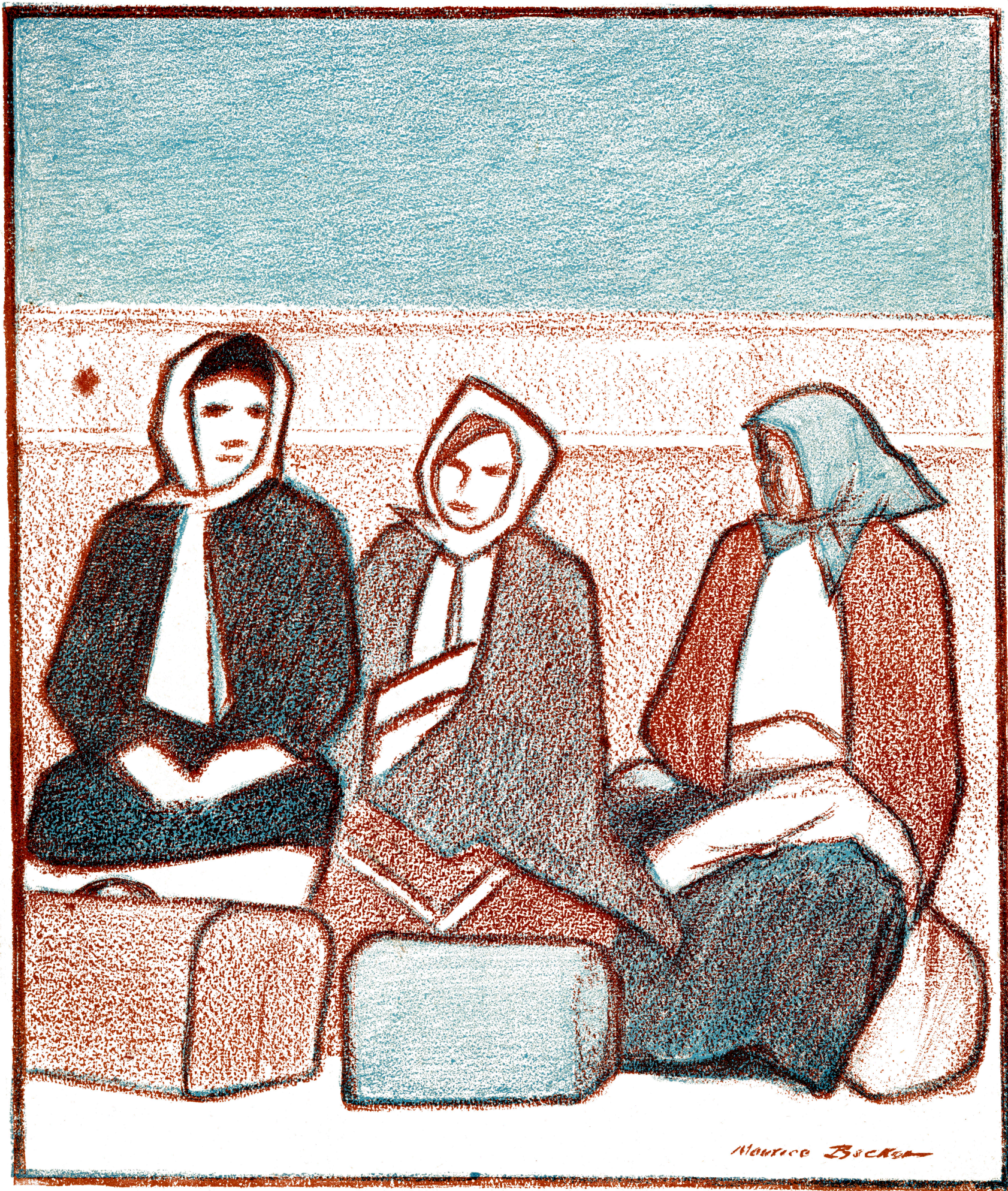
Drawn by Maurice Becker.