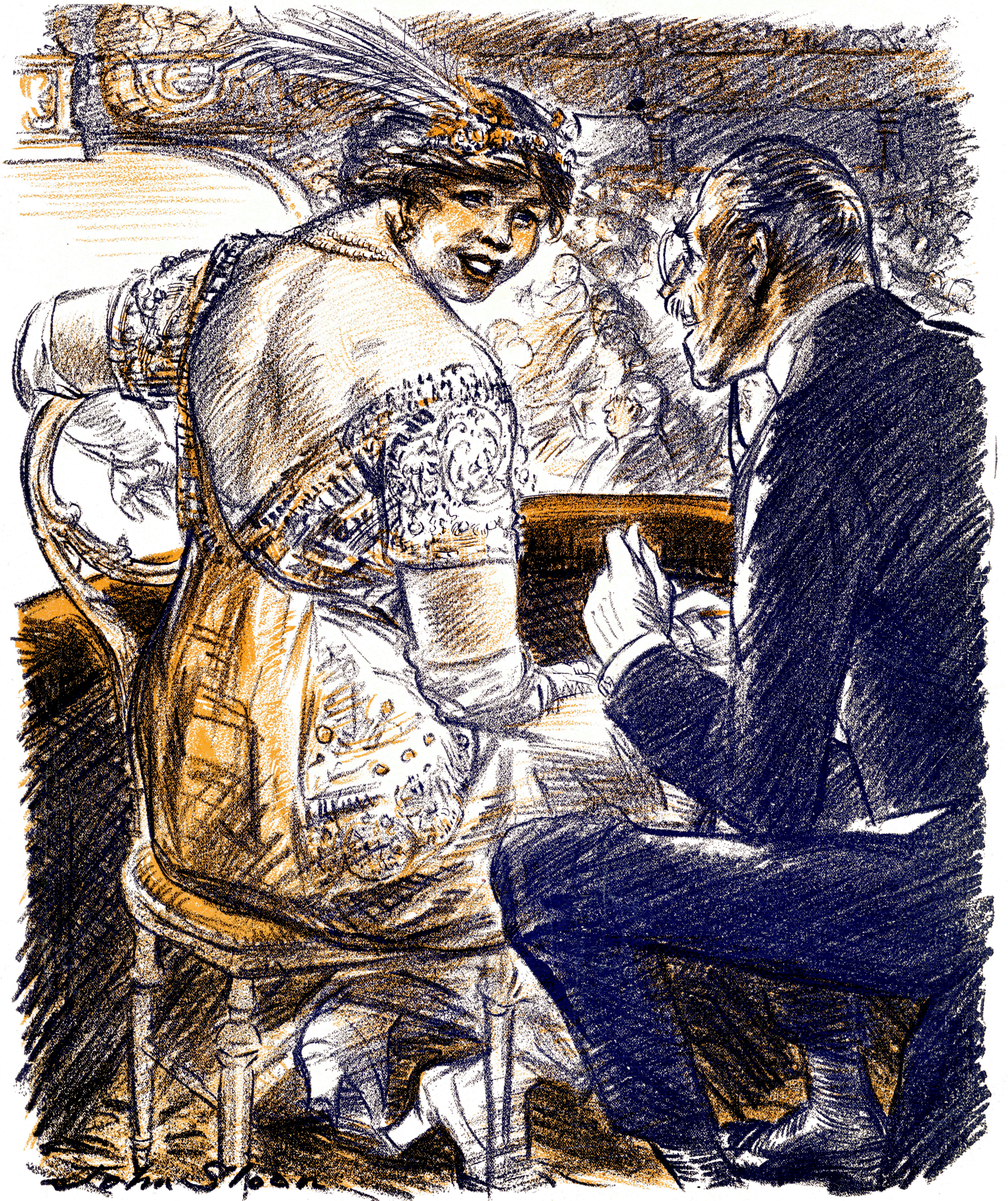
Drawn by John Sloan.