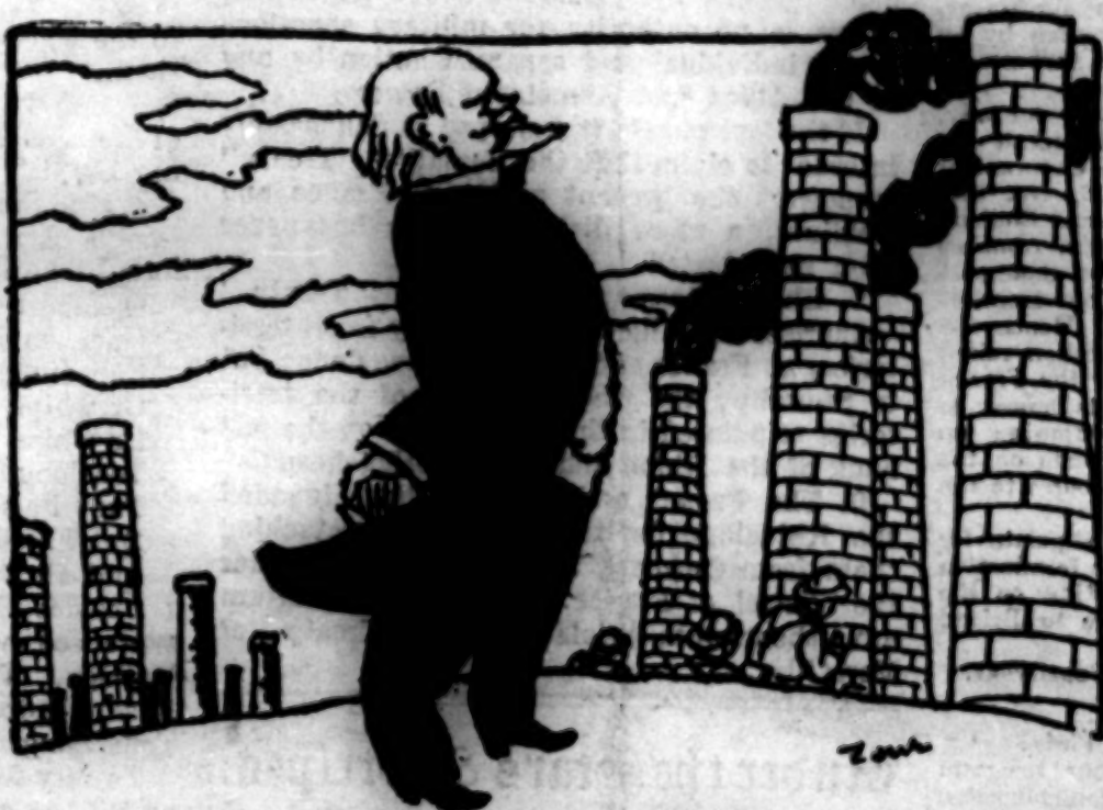
"COCK OF THE WALK."

It is thus that Governments deny their ignoble doings when efforts are made to bring them forth into the light of publicity.