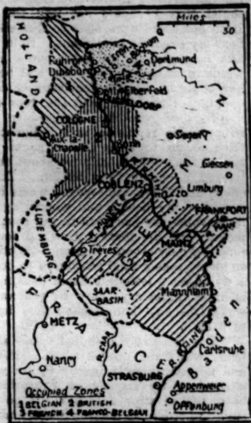
The territories occupied by the Allied Powers on the left bank of the Rhine and at the bridgeheads on the right, as provided by the so-called "Treaty" of Versailles.

There came the great catastrophe of 1918. In the first months of 1919 the Rhineland expected modifications in its national status. It anticipated French annexation, or autonomy, and if the first of these eventualities awakened, if not resistance—the Rhenish populations are sufficiently malleable to accept the decisions of force—at least disquietude, the second appeared, on the whole, to be desired. The Versailles peace arrived at a third solution—inter-allied occupation for five, ten, or fifteen years, but with the maintenance of