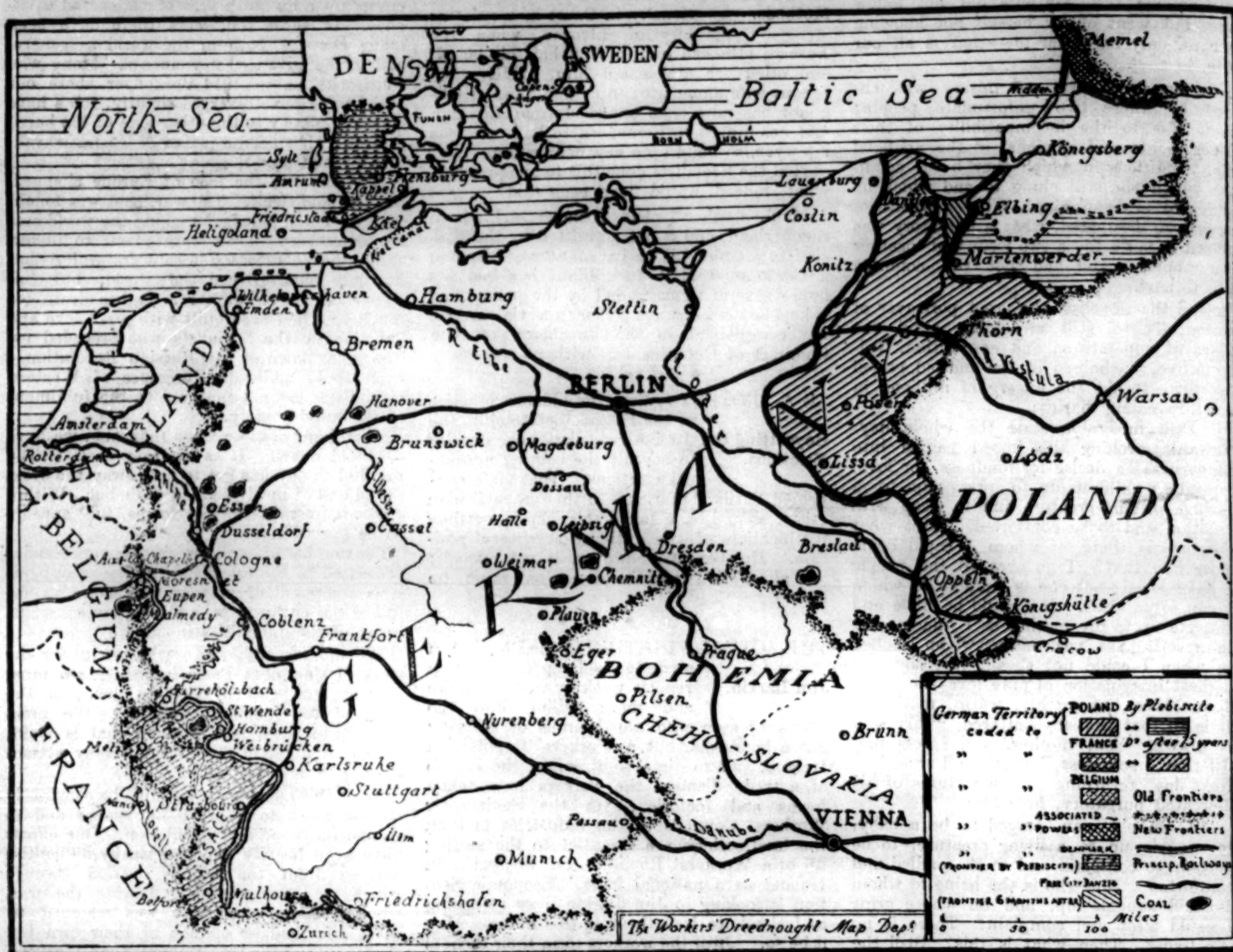
The Territorial Losses of Germany.

Showing the territory lands north-east and west taken from Germany by the Allies at the close of the 1914-18 war.