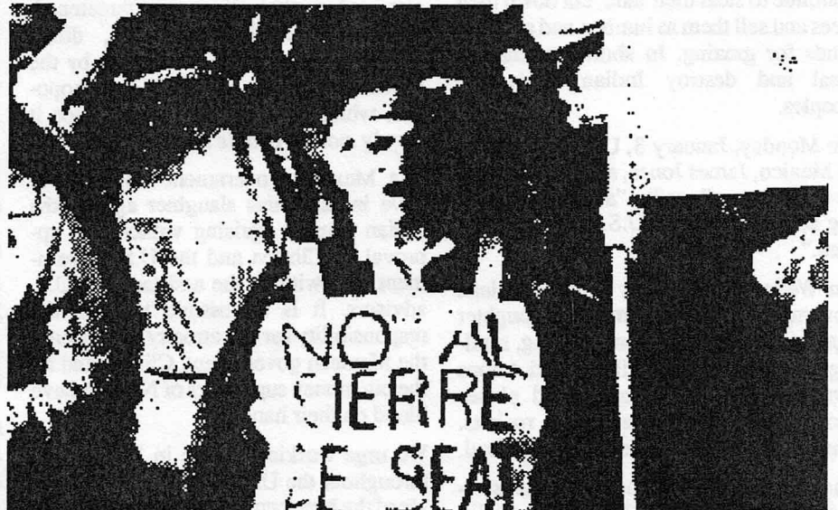
Workers demonstrate against the closing of SEAT, an auto factory in Barcelona.

There is an alternative to layoffs, speedup, cuts in social services. Cut the work week without cutting pay. Divide all the work that's available among everyone available to work. If this means cutting the bosses' profits, too bad.—M.G.