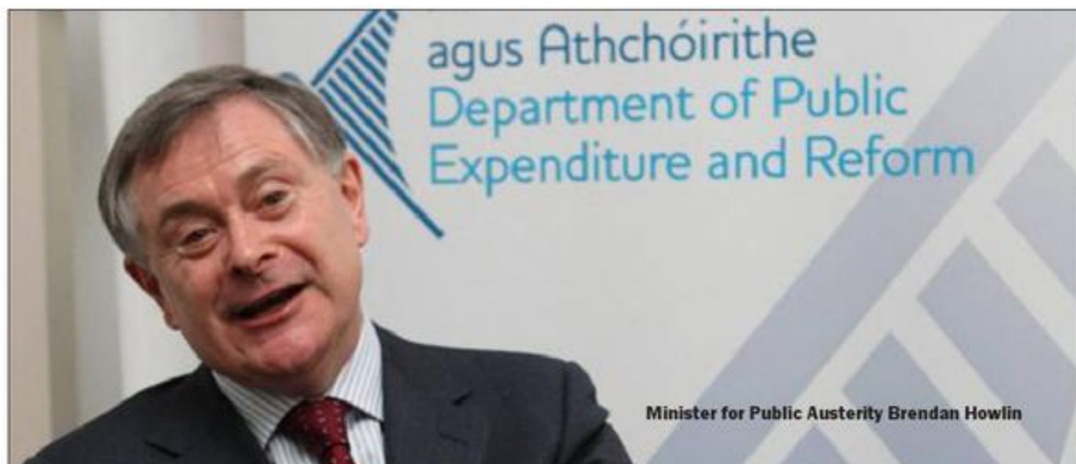
Minister for Public Austerity Brendan Howlin

But they failed to emphasise that such workers had to give an hour's