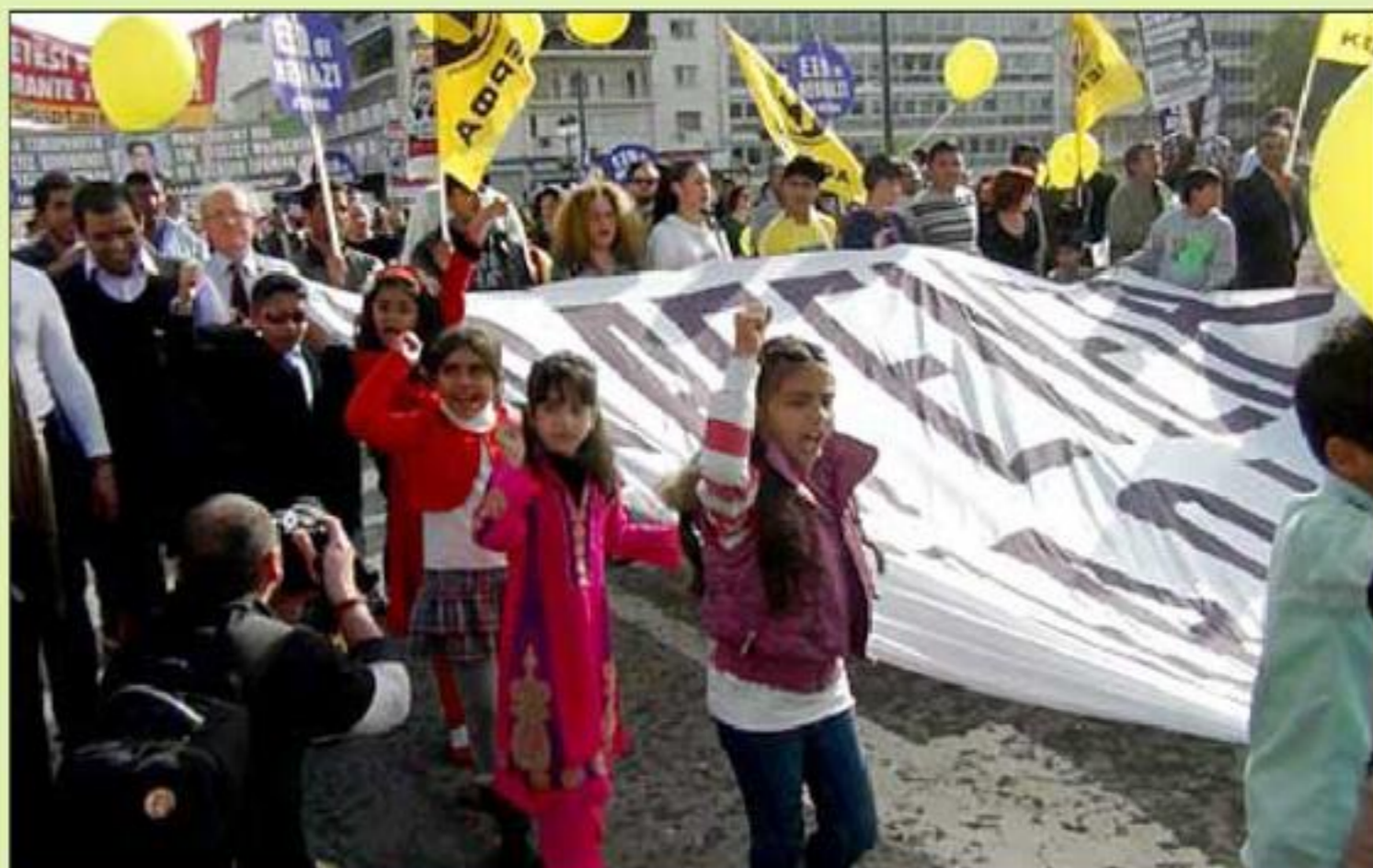
Thousands of people marched in Athens, Greece, on Saturday 30 March, against a proposed new law to prevent the children of migrants from gaining Greek citizenship