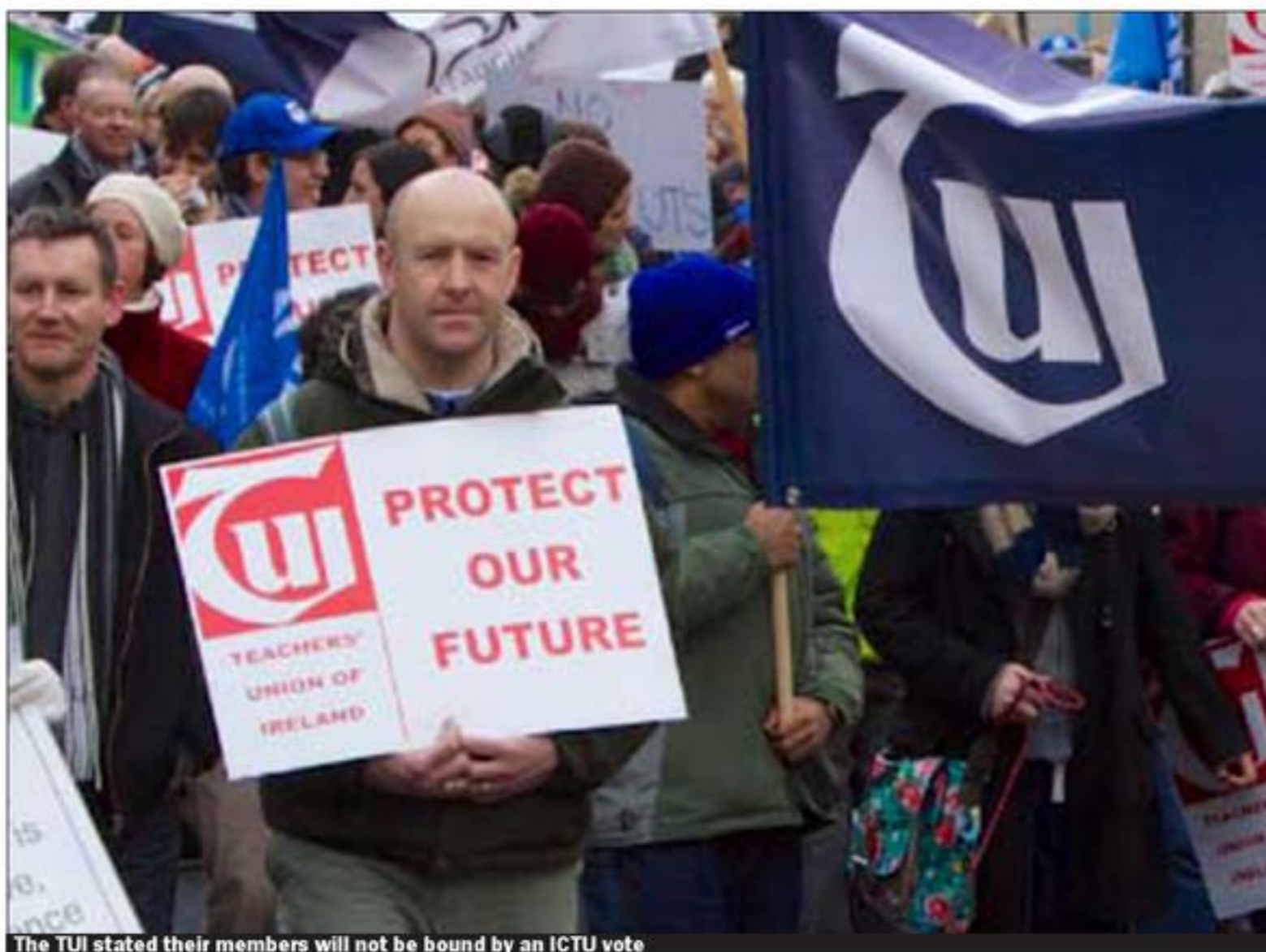
The TUI stated their members will not be bound by an ICTU vote

free overtime to their employers and that they were being signed up for a review of travel and subsistence allowances.