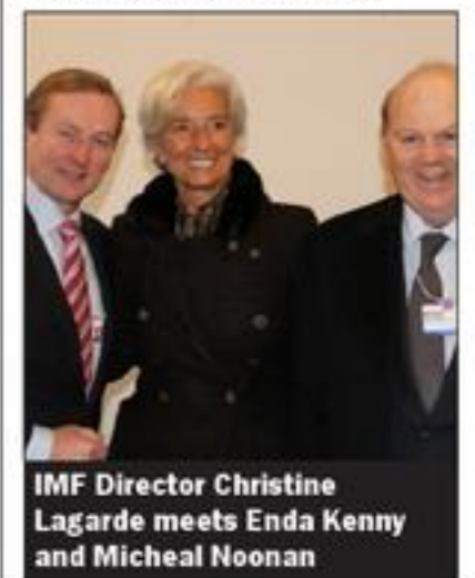
IMF Director Christine Lagarde meets Enda Kenny and Micheal Noonan

The government has responded by promising to change the law to make