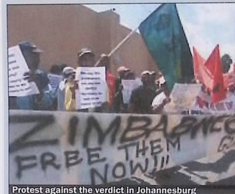
Protest against the verdict in Johannesburg