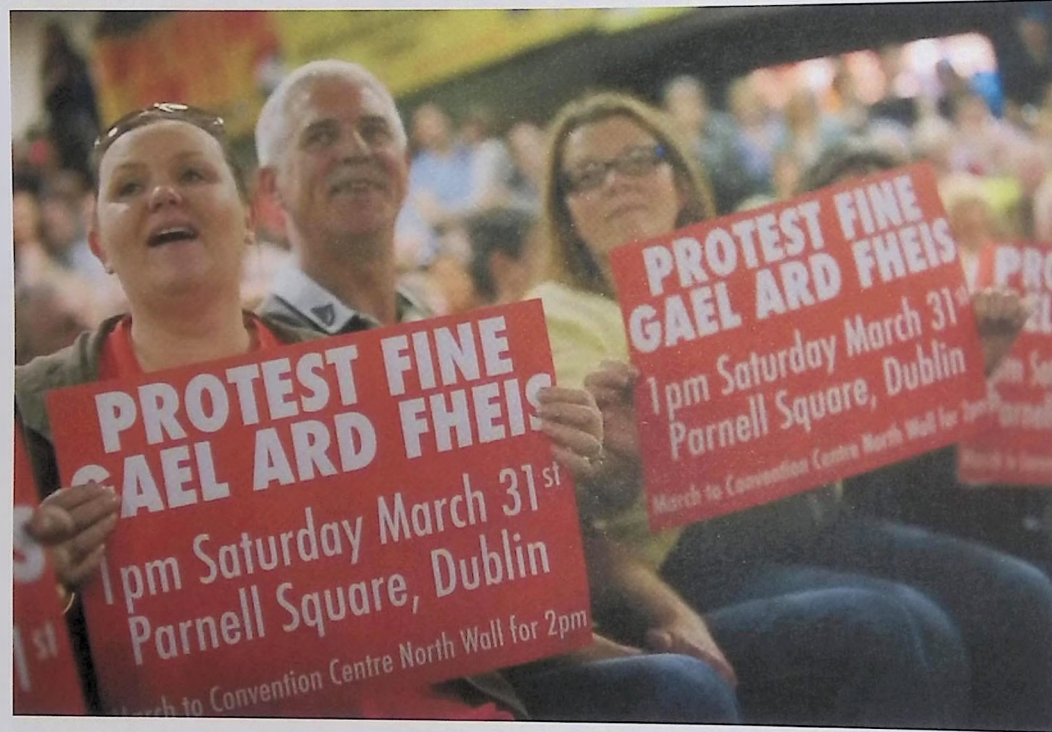
All the speakers made the point that while non-payment is central, mass mobilizations and civil disobedience are essential to breaking the govern-

ment's resolve. The household tax will be defeated through people demonstrating on the streets in their tens of thousands. There