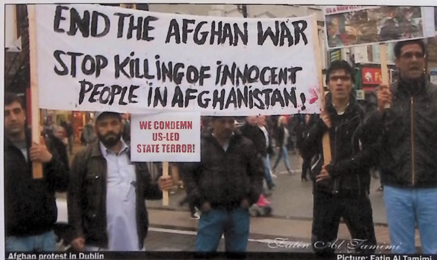
Afghan protest in Dublin

'In any case it would have been impossible for one soldier to walk three kilometres from