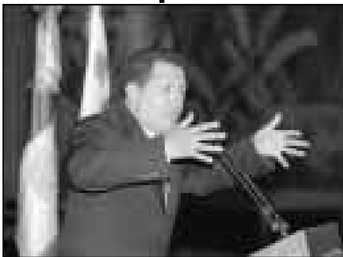
■ Hugo Chávez, once again under pressure from a right-wing coup, and (right) Roger Noriega: threats

The purpose of the operation, according to one of the anti-Chávez generals, was to "steal arms from the base to give to a 3,000 strong paramilitary group". Their ultimate aim, to cause a crisis of stability in Venezuela giving the necessary pretext for an intervention by Colombia's armed forces.