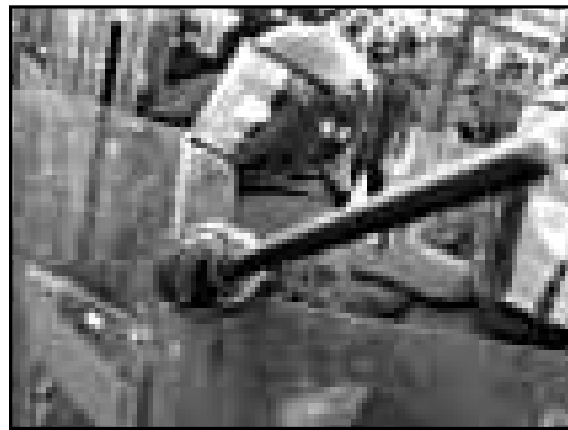
Garda overkill on May Day

"Training began in January 2003, not just for the May