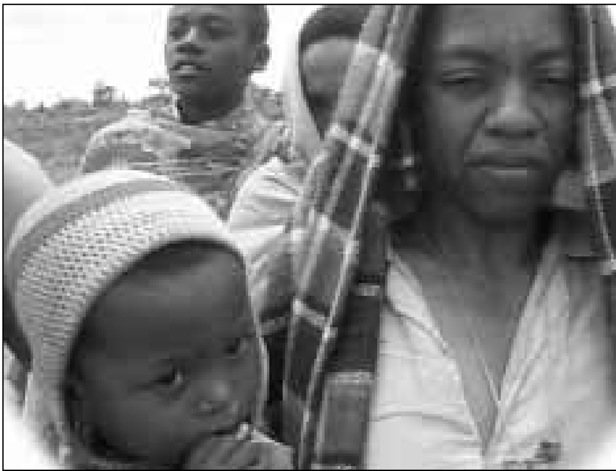
■ McDowell says 'Not Welcome'