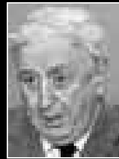
Looking out for each other: Charles J Haughey, Dermot Gleeson, Peter Sutherland and Garrett Fitzgerald

THE banks get away with robbery because there is a golden circle that links the business and political elite.