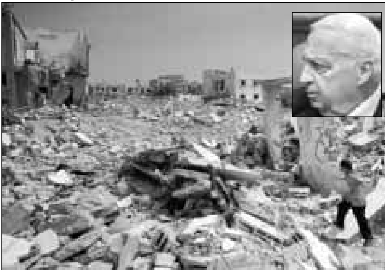
■ Devastation in Gaza as Sharon (inset) orders houses razed to the ground

"All this is the decision of Bush and Sharon. They are the same thing. The