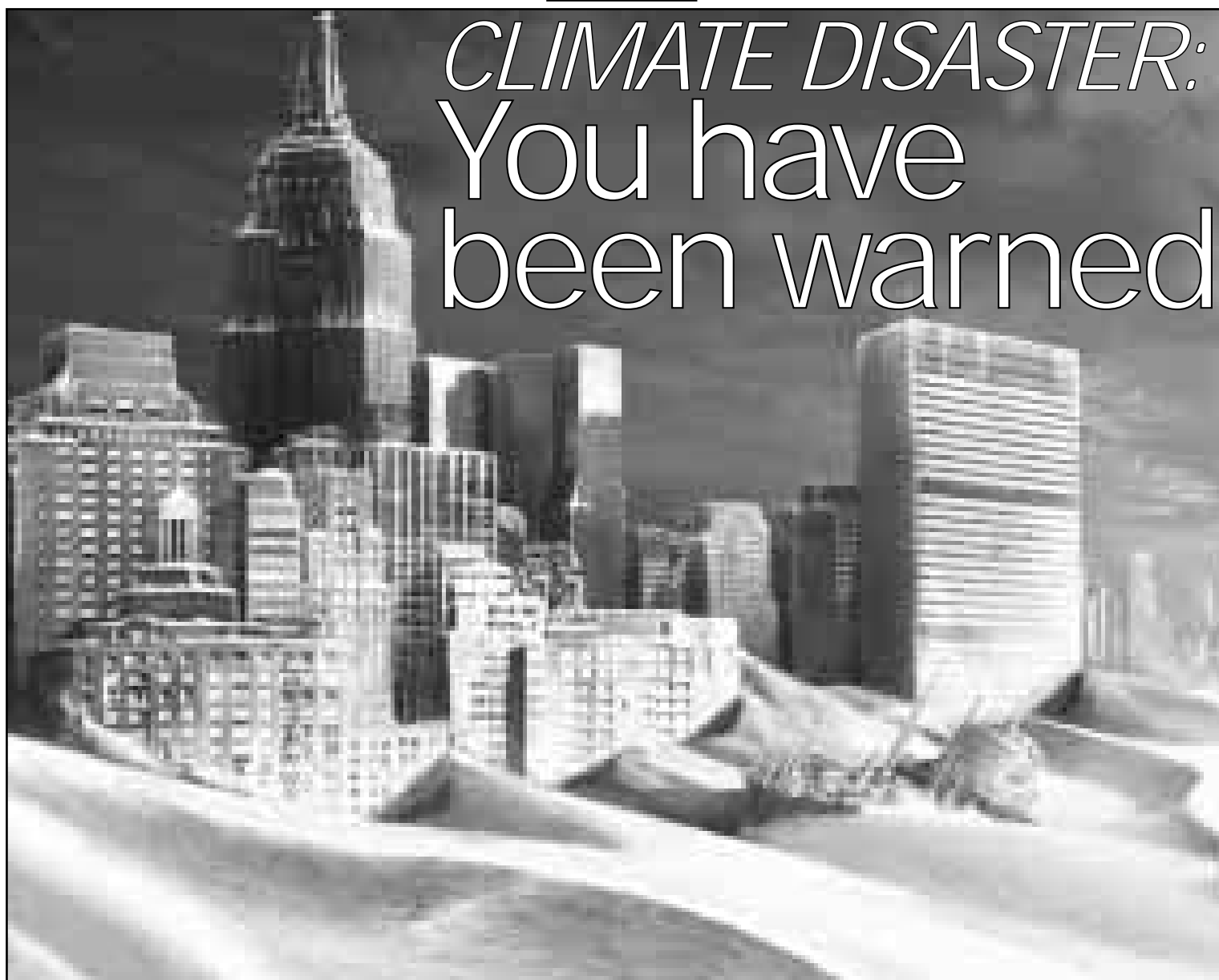
■ The New York skyline after climate change devastates the planet