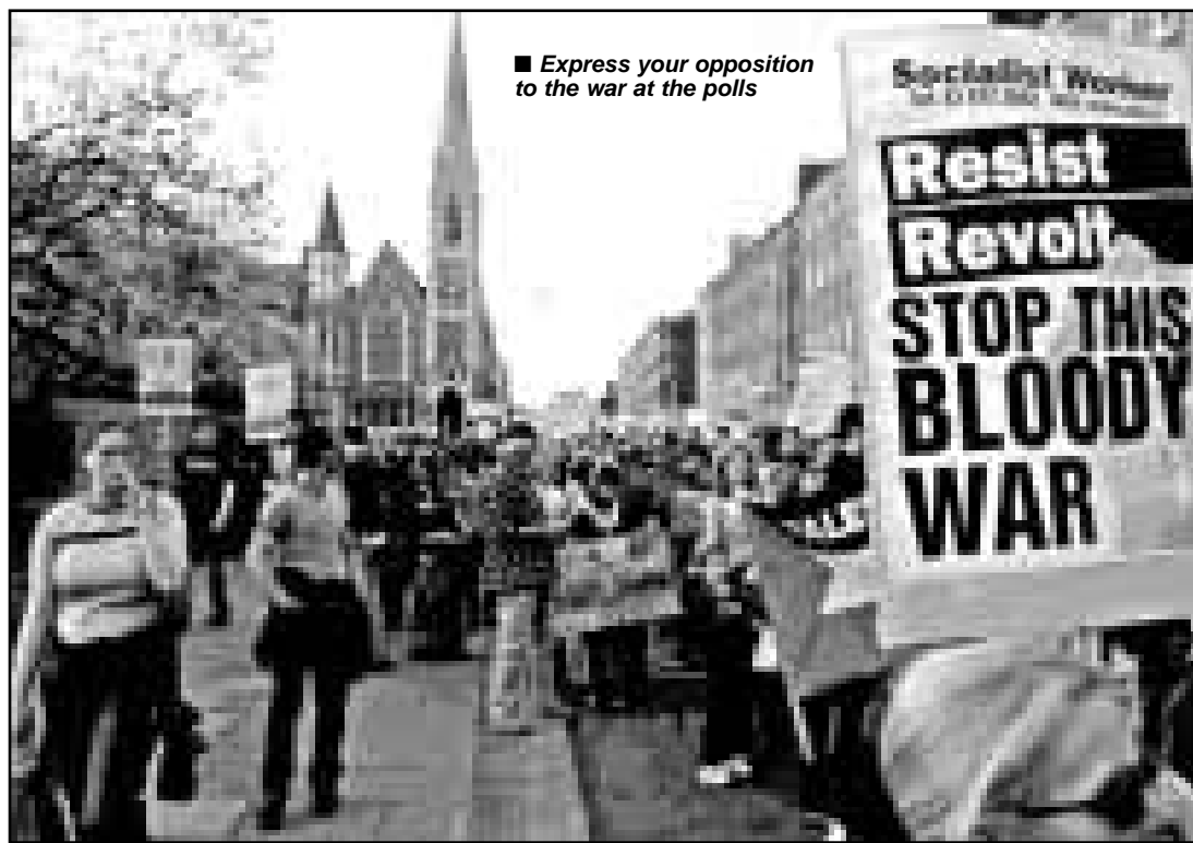
Express your opposition to the war at the polls

In the local elections there is a host of socialist candidates standing – you can see the SWP candidates in the box below.