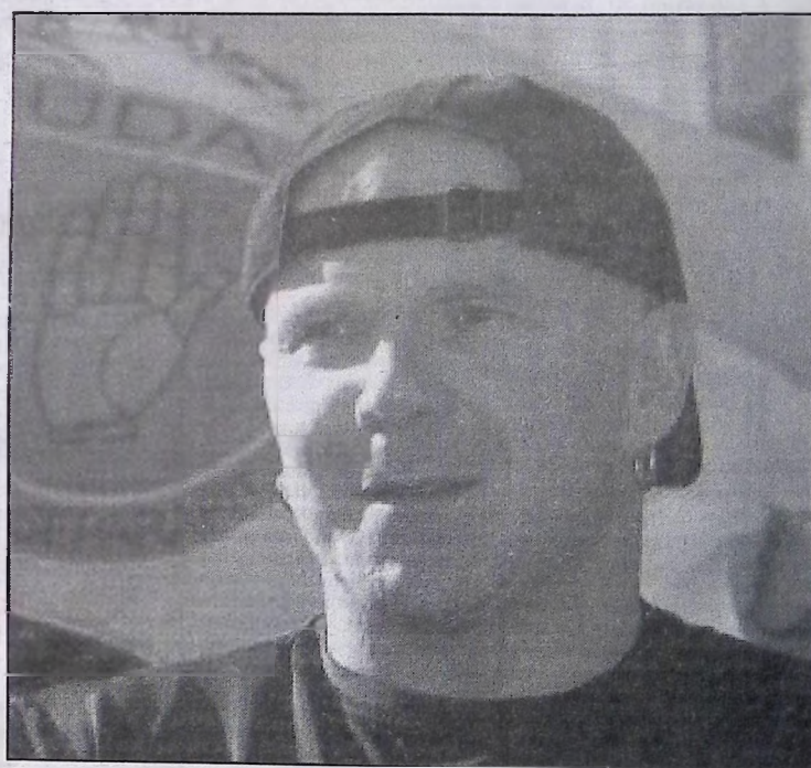
Johnny "Mad dog" Adair

They only represent a tiny minority of working class Protestants.