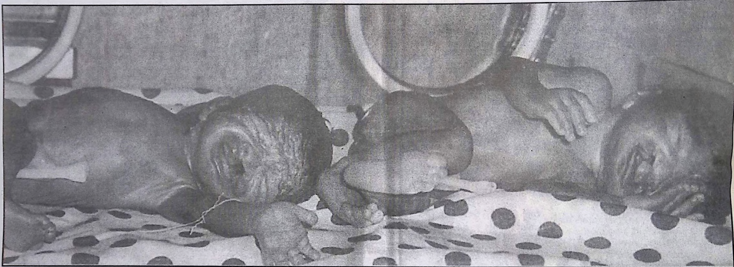
THE EFFECTS of Depleted Uranium on Iraqi children

Out of his 50 strong team, 10 people died of cancer. Only one did not get any illness and he was covered in radioactive clothing all the time.