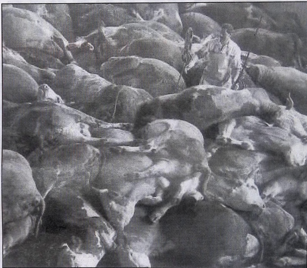
Thousands of cattle culled because of the BSE crisis

So instead this government wants PAYE workers to pay more refuse charges and put up with incinerators.