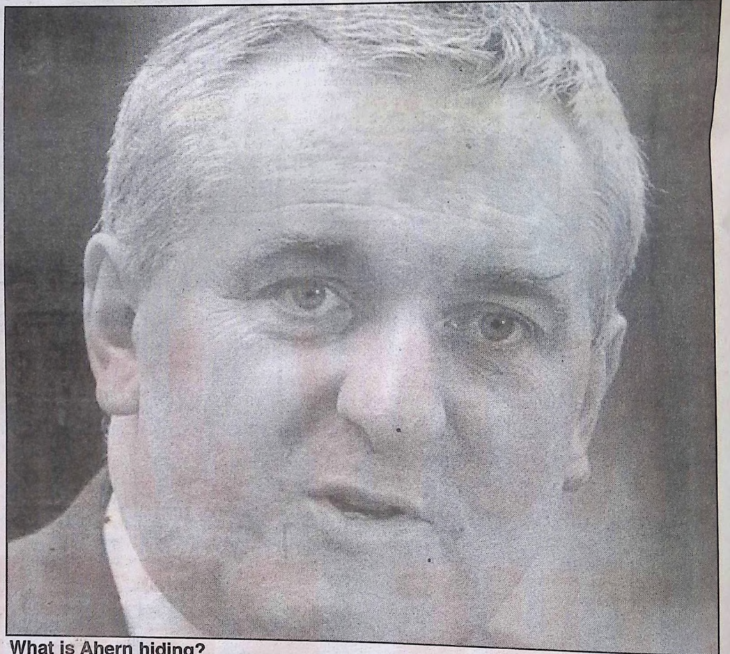
What is Ahern hiding?