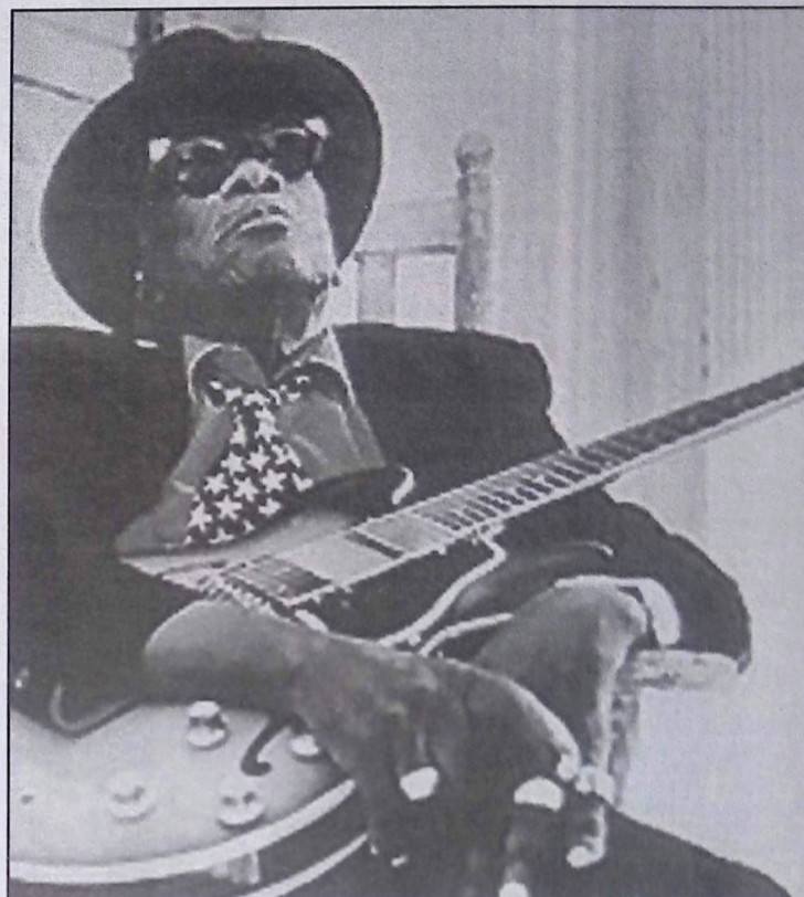
John Lee Hooker

miserable, despite everything that the world and the system can throw at you.