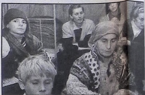
Refugees fleeing Russia's war

In the town of Alkhan-Yurt, for example, journalists report that every single building has been smashed and ripped apart by Russian bombs. Over one third of the Chechen population has been made homeless and over 200,000 refugees are facing cold, disease and squalor in neighbouring Ingushetia.