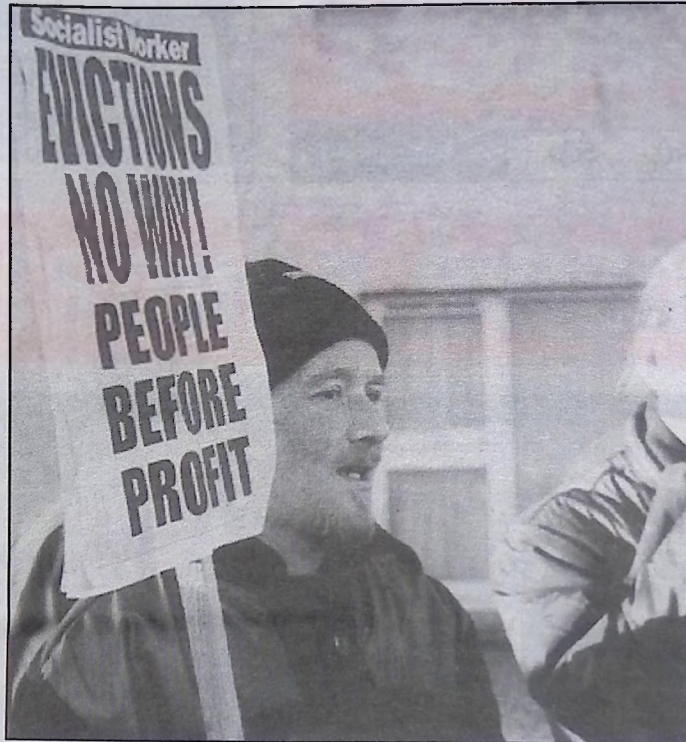
she told Socialist Worker .

If evicted, they would have to spend Christmas in a B&B or a hostel. "That's no place for my kids to spend Christmas,"