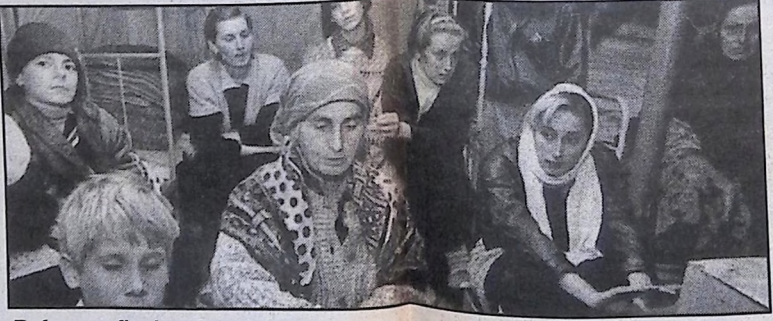
Refugees fleeing Russia's war

In the town of Alkhan-Yurt, for example, journalists report that every single building has been smashed and ripped apart by Russian bombs. Over one third of the Chechen population has been made homeless and over 200,000 refugees are facing cold, disease and squalor in neighbouring Ingushetia.