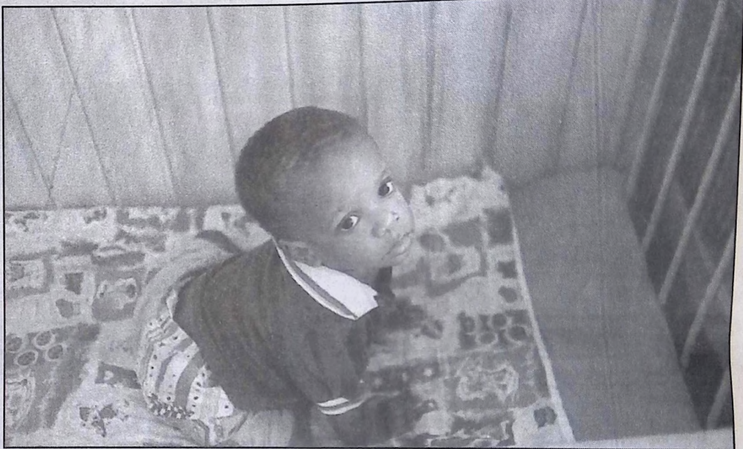
A child dying of AIDS in South Africa

However a closer look shows how Al Gore has received millions of dollars in campaign contributions from many of the