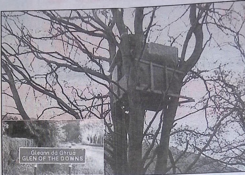
FIGHTING the car lobby