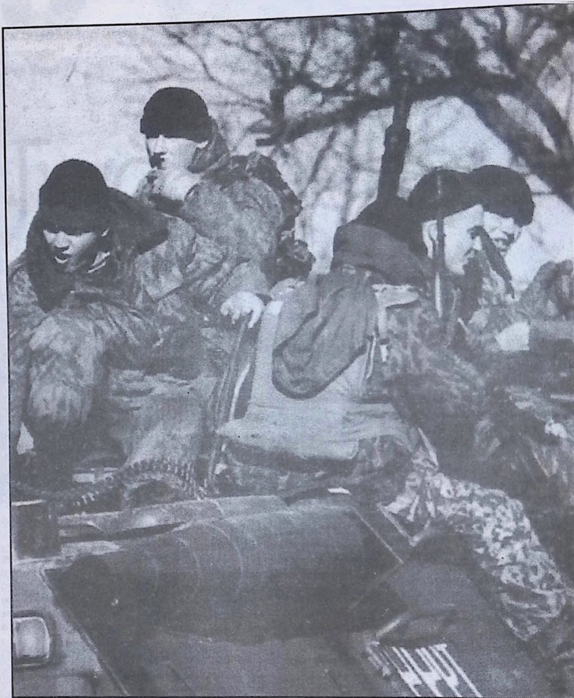
Russian troops and one of their victims

It arms sales help fuel regional arms races like that between Greece and Turkey or between two nuclear states,