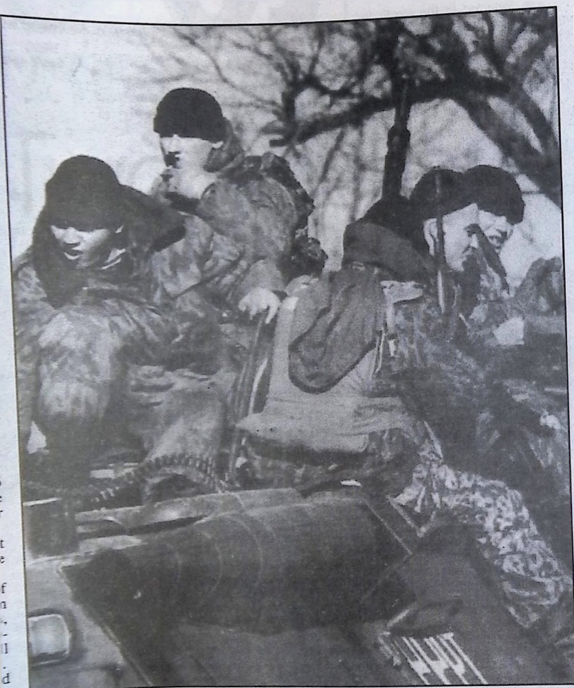
Russian troops and one of their victims