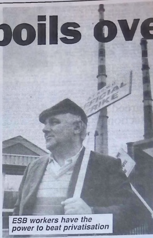
ESB workers have the power to beat privatisation

Electricity prices in Ireland are the cheapest in Europe.