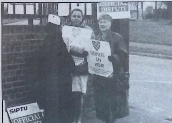
THE INDUSTRIAL action of nurses across Ireland is fantastic.

Once moderate organisations like the Irish Nurses Organisation, which used to ban strike action, have officially backed their members.