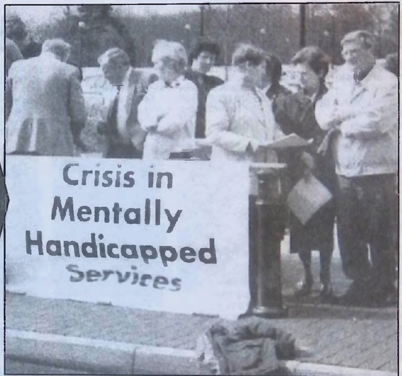
■ Hospital workers take action against overcrowding and underfunding