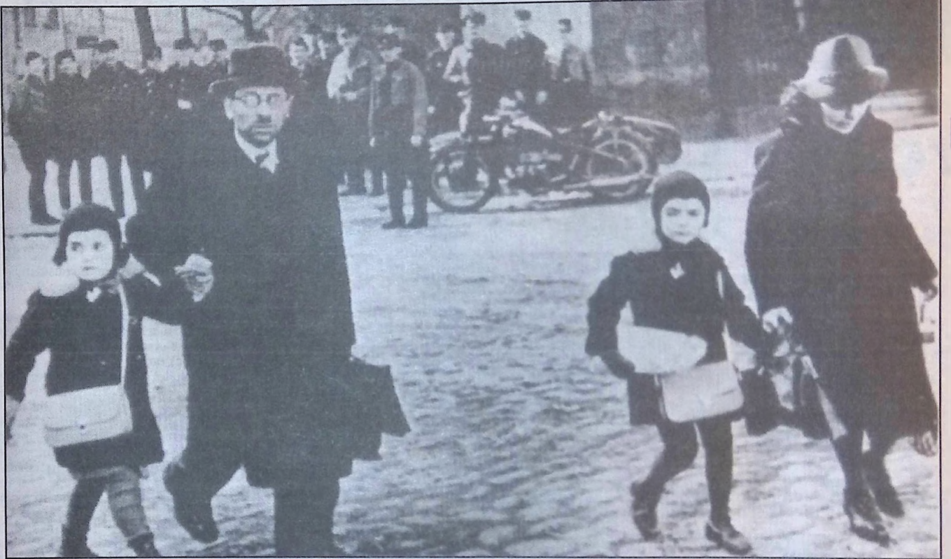
Above: A Jewish family is driven out of their home watched by grinning Nazis. Top right: Trotsky: Argued for unity against the Nazis

He predicted that the Nazis would be far worse than even the Italian fas-