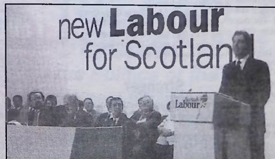
Blair: Fighting to drop Clause Four

It committed Labour to common ownership of industry and services.