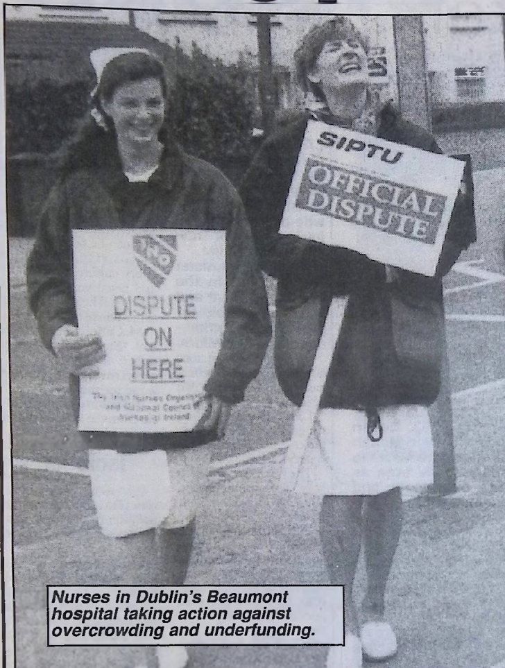
Nurses in Dublin's Beaumont hospital taking action against overcrowding and underfunding.

THE LABOUR Party leadership showed a high level of confidence at their party's conference in Limerick. But in reality thousands of working class people are sickened and disillusioned with their sell-outs.