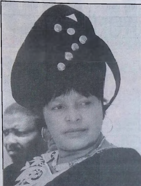
Winnie Mandela: "This is not the South Africa I ruined my life for"

When she said last week "This is not the South Af-