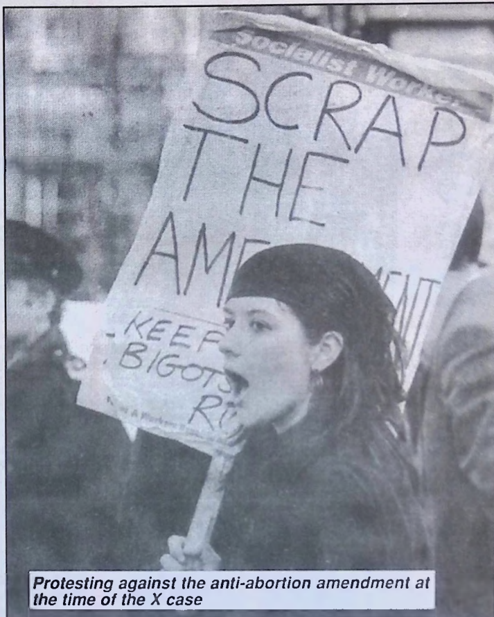
Protesting against the anti-abortion amendment at the time of the X case