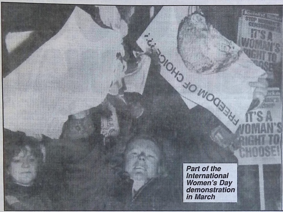
Part of the International Women's Day demonstration in March

THERE IS nothing more gratifying than seeing a Tory Minister like Patrick Mayhew humiliated.