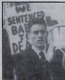
Behind the respectable image lurk the hard men of Youth Defence

I had known for some time that these organisations based their teachings on threats and intimidation but to be honest until I was actually at the receiving end I did not fully believe all the stories. I find it all very sad that so called Christians will resort to such extreme violence in order to gain their objectives. I was there as were my friends to demonstrate a