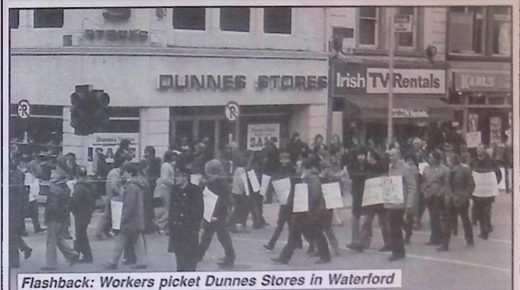
Flashback: Workers picket Dunnes Stores in Waterford

"SEVENTY per cent of theft in Dunnes Stores are caused by the workers."