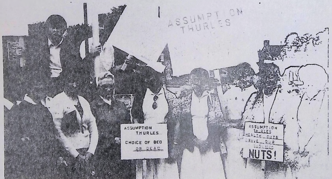
Staff of Hospital of the Assumption, Thurles at the Nenagh protest.

As he put it himself: "This is one death — and we have not yet come to a decision on cutbacks!"