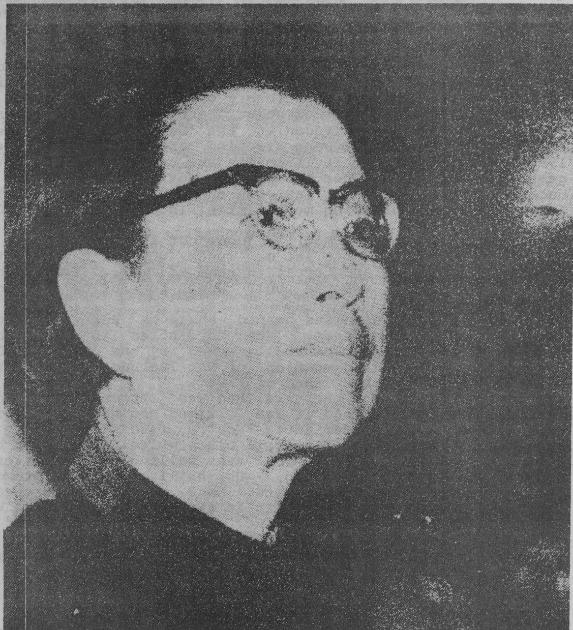
COMRADE CHIANG CHING, OUTSTANDING REVOLUTIONARY LEADER AND FIGHTER.