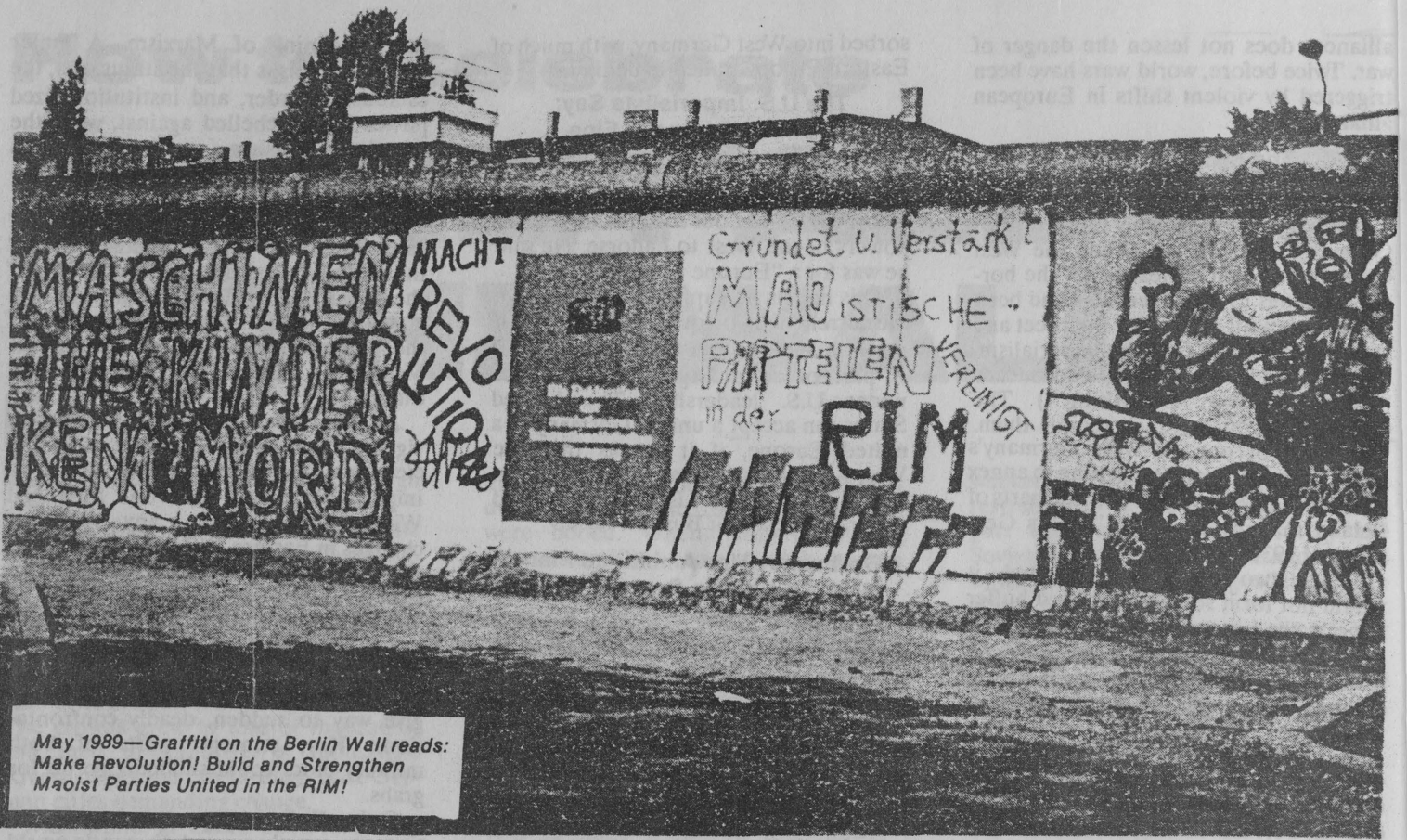
May 1989—Graffiti on the Berlin Wall reads: Make Revolution! Build and Strengthen Maoist Parties United in the RIM!