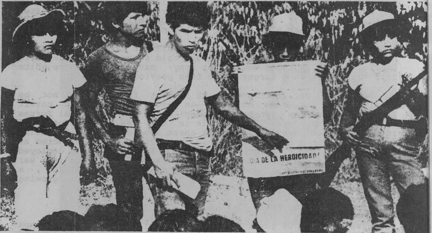
Guerrilla fighters of the PCP carry out propaganda work among the people in the countryside

"Time" magazine remarks: "The military aspects of the plan, however, are stirring the most misgivings. To fulfil Bush's campaign promise more and heavier US weapons would have to be dispatched to Colombia, and more arms and men to Peru and Bolivia." The same article notes that "Peruvian military leaders are desperate to turn back sendero guerrillas." "I will take help from anyone who offers it" says a top Peruvian officer. In fact, contingents of American Green Berets have already been sent to Peru and Bolivia to train anti-narcotics police units in counter-subversion and jungle warfare." The US might find, however, that it is easier to talk about suppressing people's war than to do it, as they found to their cost in Vietnam.