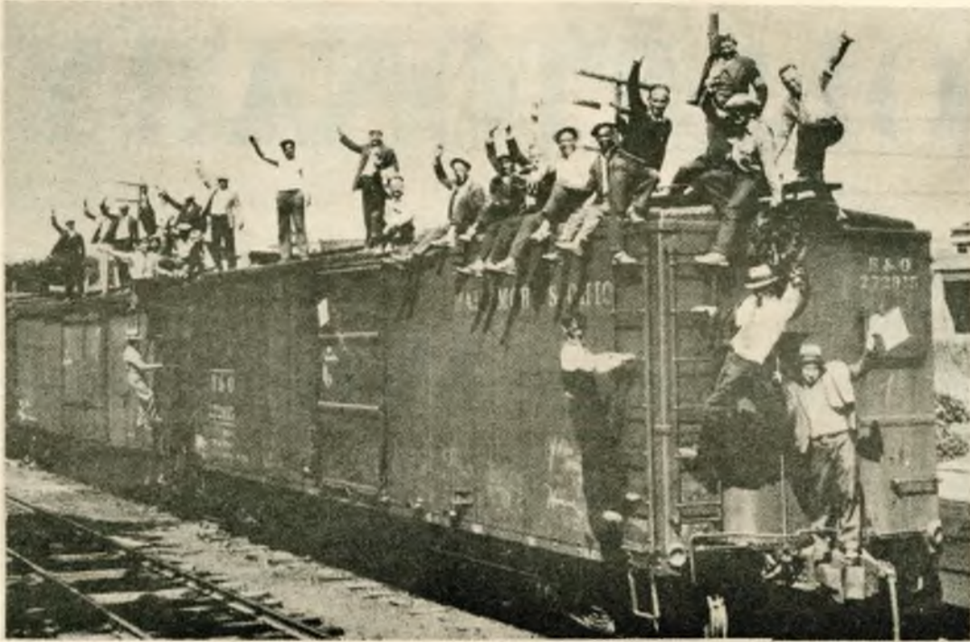
War veterans arriving in Washington for the bonus protest. Sympathetic train crews helped them along the way, sometimes billing the ex-soldiers as "livestock."

(The following is reprinted from a booklet called SOLDIERS AND STRIKERS, by Vincent Pinto, published by United Front Press.)