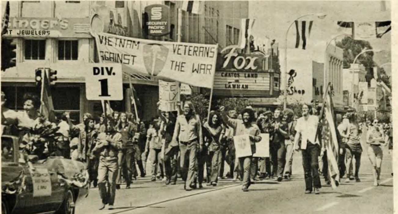
Vietnam Veterans Against the War and their supporters marched in the July 4th parade in Redwood City. More and more veterans come back from Vietnam every day who have realized that the real battle is here in the belly of the beast.

Our participation in this parade illustrated our belief that the Independence Day celebration is a hollow mockery as long as the genocidal war against the Vietnamese people continues. The viewpoint of our members and supporters