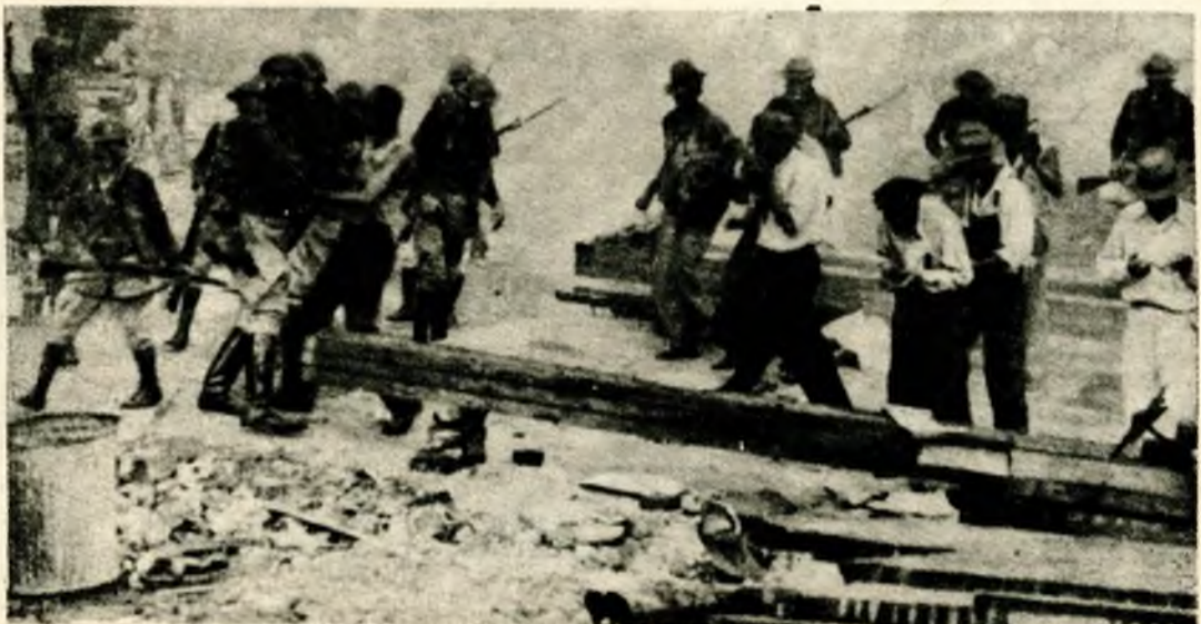
At orders from President Hoover, MacArthur and Eisenhower's troops gassed and shot the veterans at the Battle of Anacostia Flats and burned their shacks to the ground.

(The government still doesn't like to see vets not being grateful for the opportunity to give their life blood for the wars of big business. See the other article in this issue about the anti-war vets on July 4th.)