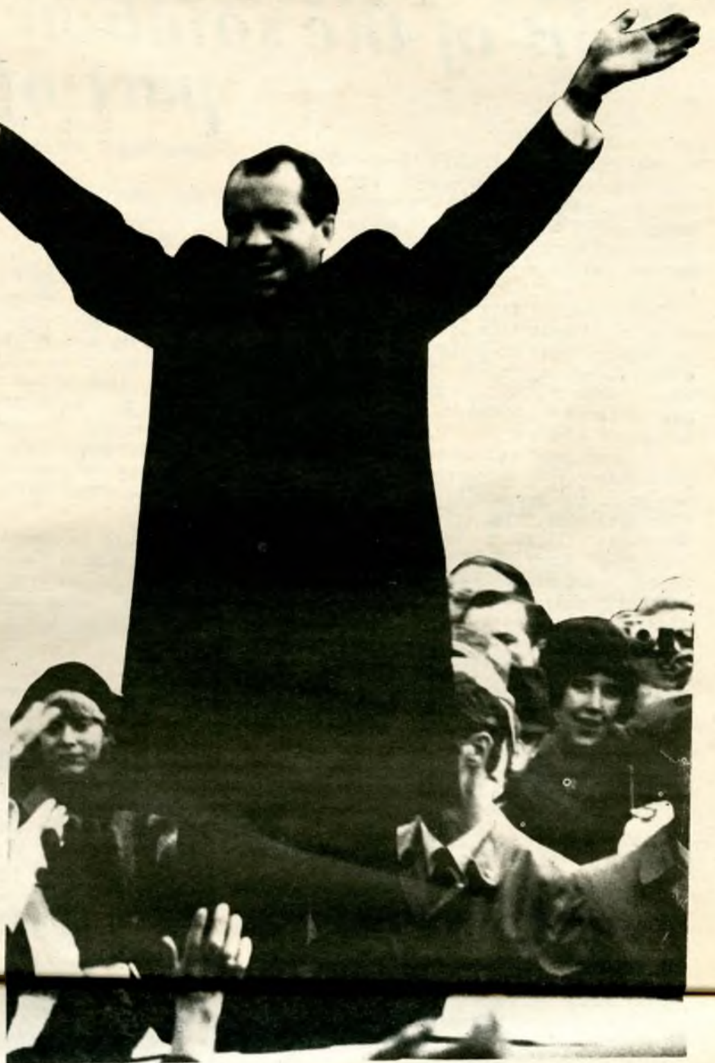
MOVEMENT OF THE PEOPLE

The nomination of McGovern not only signals the surrender of part of the U.S. imperialist ruling class to the Vietnamese people, it also shows that Mao Tse-Tung's statement "Revolution is the main trend in the world today!" also applies to the United States. For in order to make counter-revolution, McGovern and his backers are trying to use a people's movement.