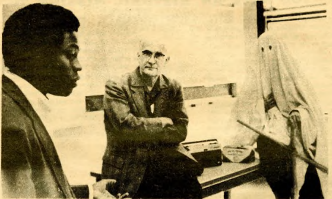
The confrontation with Shockley because of his racist teachings.