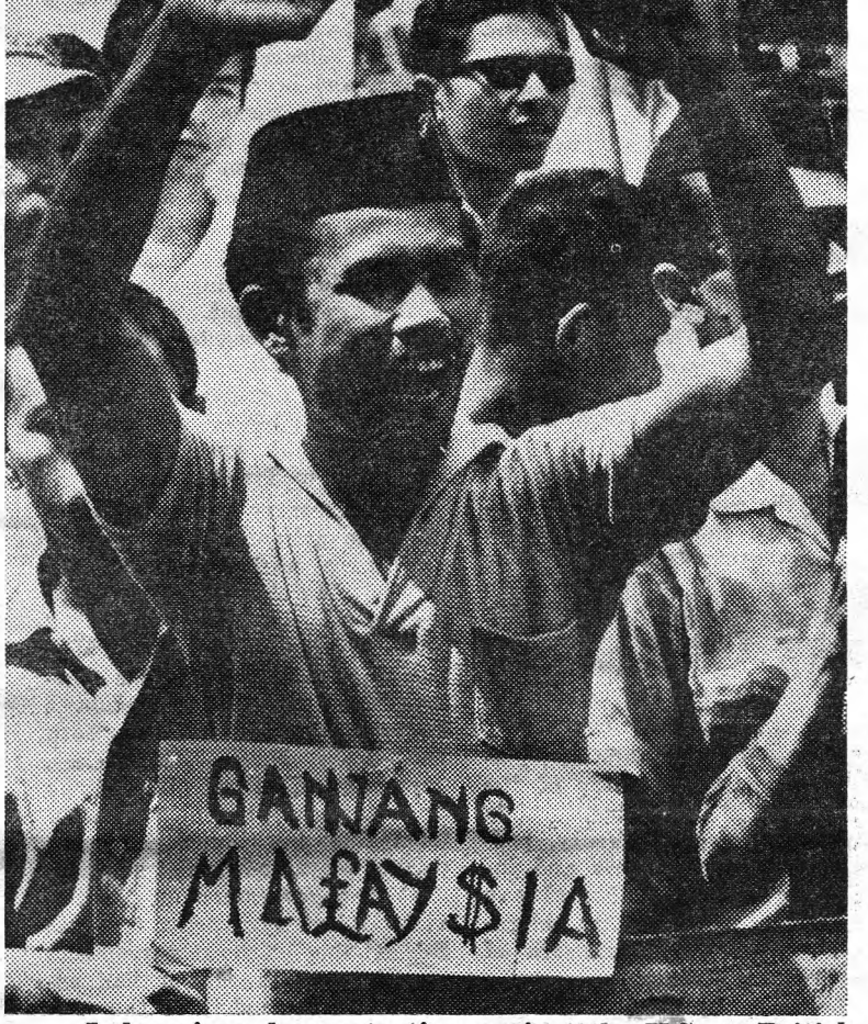
Indonesians demonstrating against the U.S. — British concocted "Malaysia" — a product of neo-colonialism.