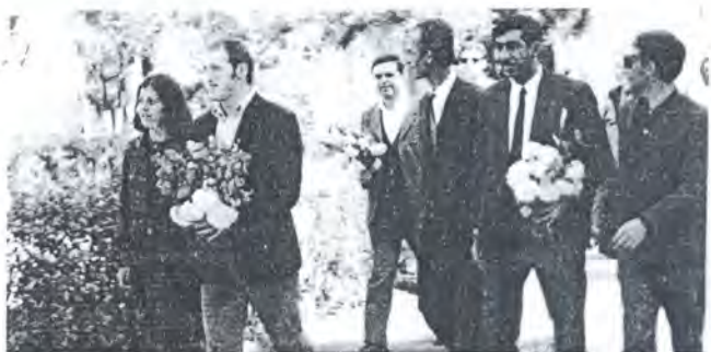
CPB(ML) DELEGATE TO MAY DAY CELEBRATIONS IN ALBANIA

"The world is our nation. No man is an island. Together we workers everywhere can be the whole world."