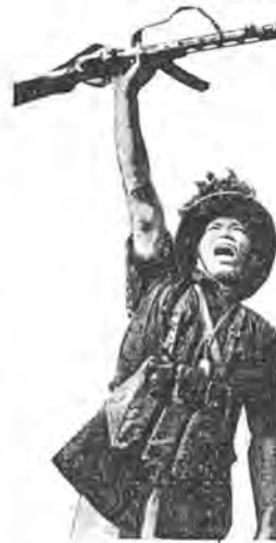
A SHARE-OWNING DEMOCRACY!

Whether Wilson or Heath gets in the task of workers remains exactly the same - to write their own history by ruthlessly opposing any stooge government the bosses set over the working class.