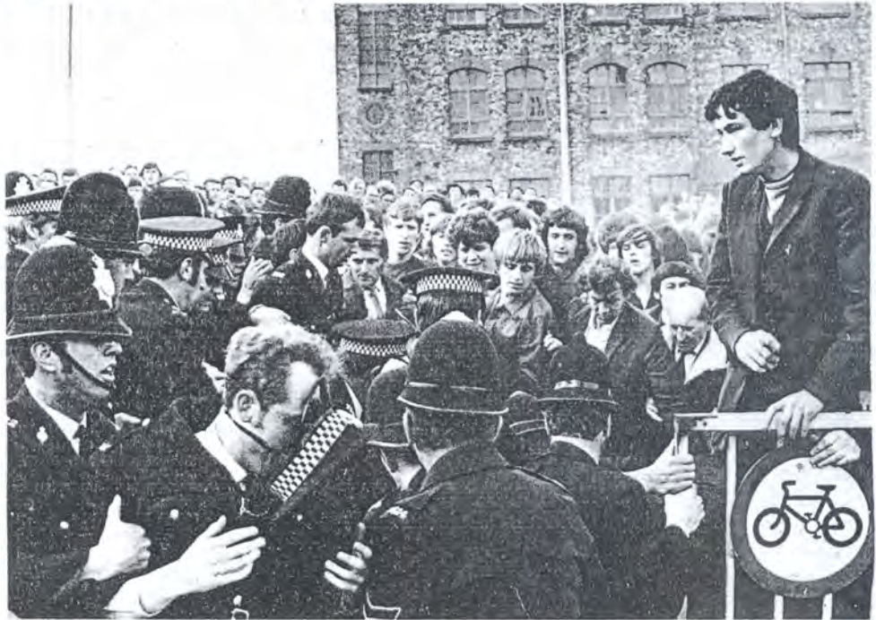
PILKINGTON STRIKERS DEFEND THEIR PICKET LINE AGAINST POLICE ATTACK

The determination of the workers, particularly when dealing with "black legs" openly encouraged by the G.M.W.U., resulted in charges of "mob rule." Such charges are always made when workers decide to "take on the gvnor," but it is worth remembering that this so called "mob" are the same people whose sweat and labour boosted Pilkington's profits last year from £13 million to £20 million and who have made the Company's five directors among