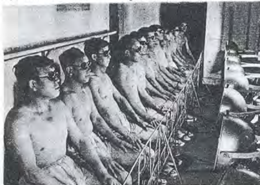
MINERS IN CHINA RECEIVING SUN-LAMP TREATMENT.

This kind of preventive care does not come by accident. There is nothing comparable in capitalist Britain. A world of difference divides medical care and preventive health treatment in a socialist country from our National Health Service, just as our nationalised coal industry is far removed from Kailuan Coal Mine. It is the difference between capitalism and socialism.