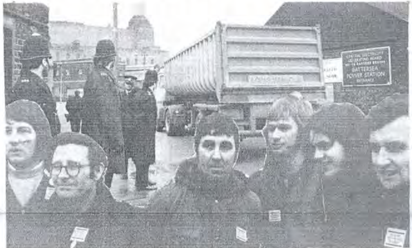
MINERS' PICKETS OUTSIDE BATTERSEA POWER STATION

This is not the only escape route the government could have used. There was the winding time and bathing time loophole. But Heath thought that his introduction of the three-day week would break the working class resistance to the freeze, would turn people against the miners, and so that loophole was closed by the ever-obedient Pay Board. But the miners stuck to their guns. They were not diverted by the election farce. They made it clear that they wanted their claim