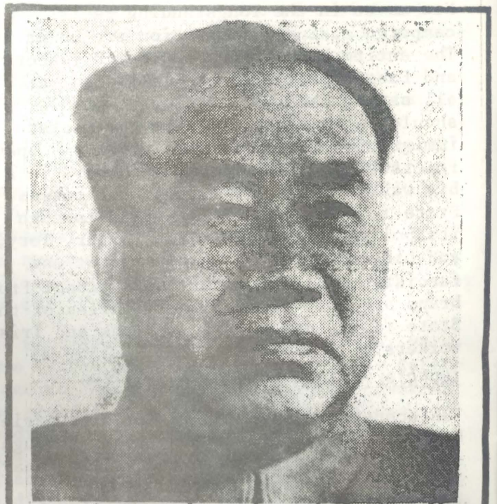
Comrade Chu Teh. Member of the Standing Committee of the Politbureau of the Communist Party of China Central Committee. Chairman of the Standing Committee of the National Peoples Congress. An outstanding revolutionary fighter.

In 1949, the People's Republic of China was established with the CPC as the leading force. Chu Teh was elected vice-chairman of the Republic. It was a New Democratic China, which was a democracy for the people, and opposed the tyranny of the foreign imperialists, such as the United States and their Chinese collaborators. It opposed the rule of the feudal tyrants and the landlords and redistributed land to the poor peasants. Later on, as the struggle for Socialism developed, he fought valiantly on the side of the working class against the capitalist roaders in the Great Proletarian Cultural Revolution. Through that revolution, China further consolidated the socialist state.