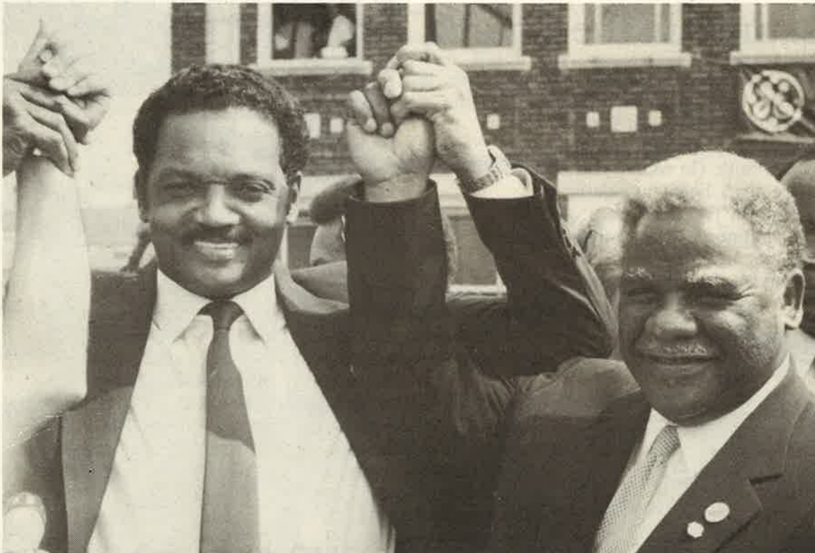
Mayor Harold Washington endorses Jesse Jackson in Chicago.

alongside striking workers of NBC affiliate WPXI. All along the route, people called out, "Run, Jesse, run! Jobs, Jesse, jobs!"