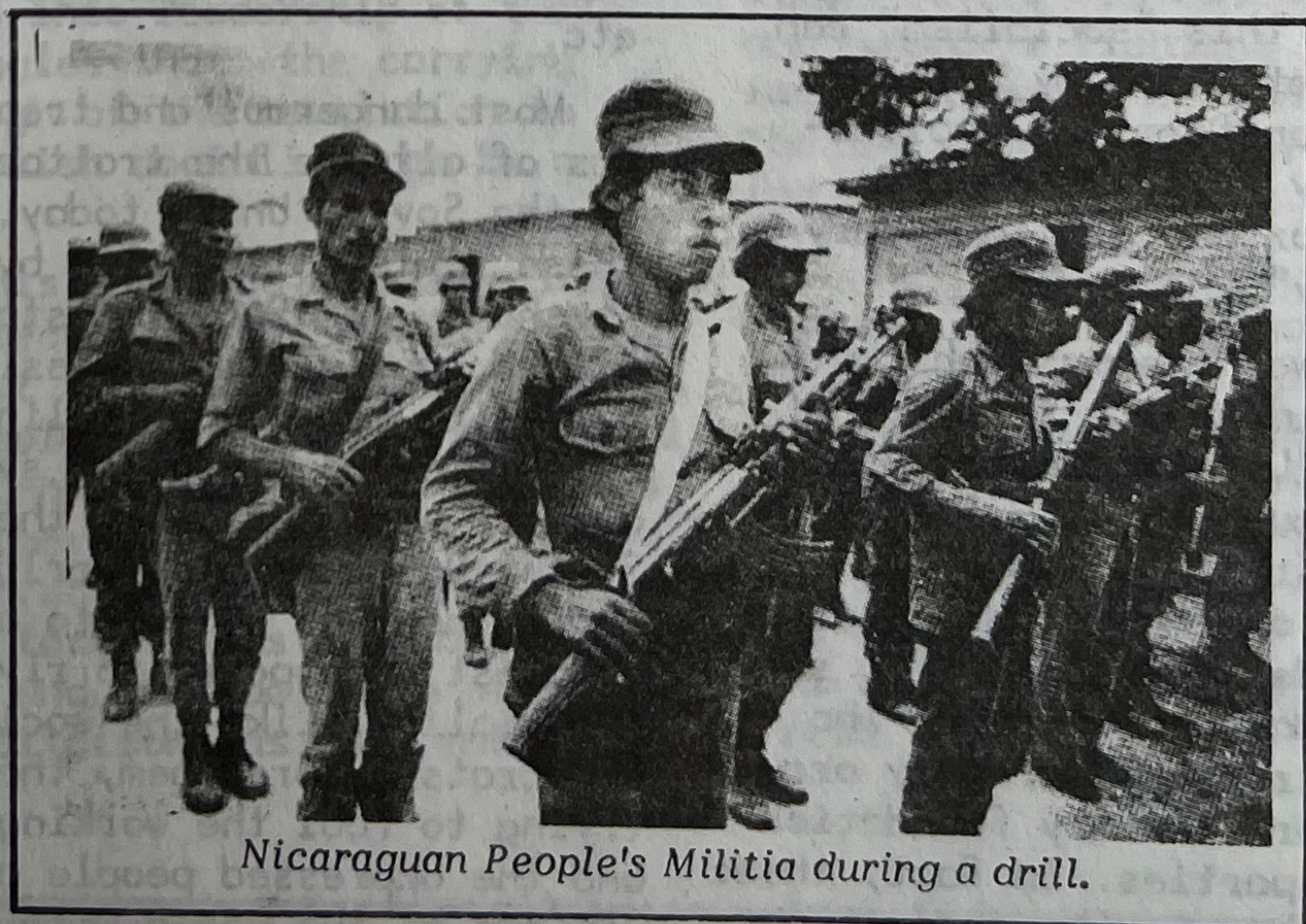
Nicaraguan People's Militia during a drill.

The Labour Party at its annual Conference took the pathetic