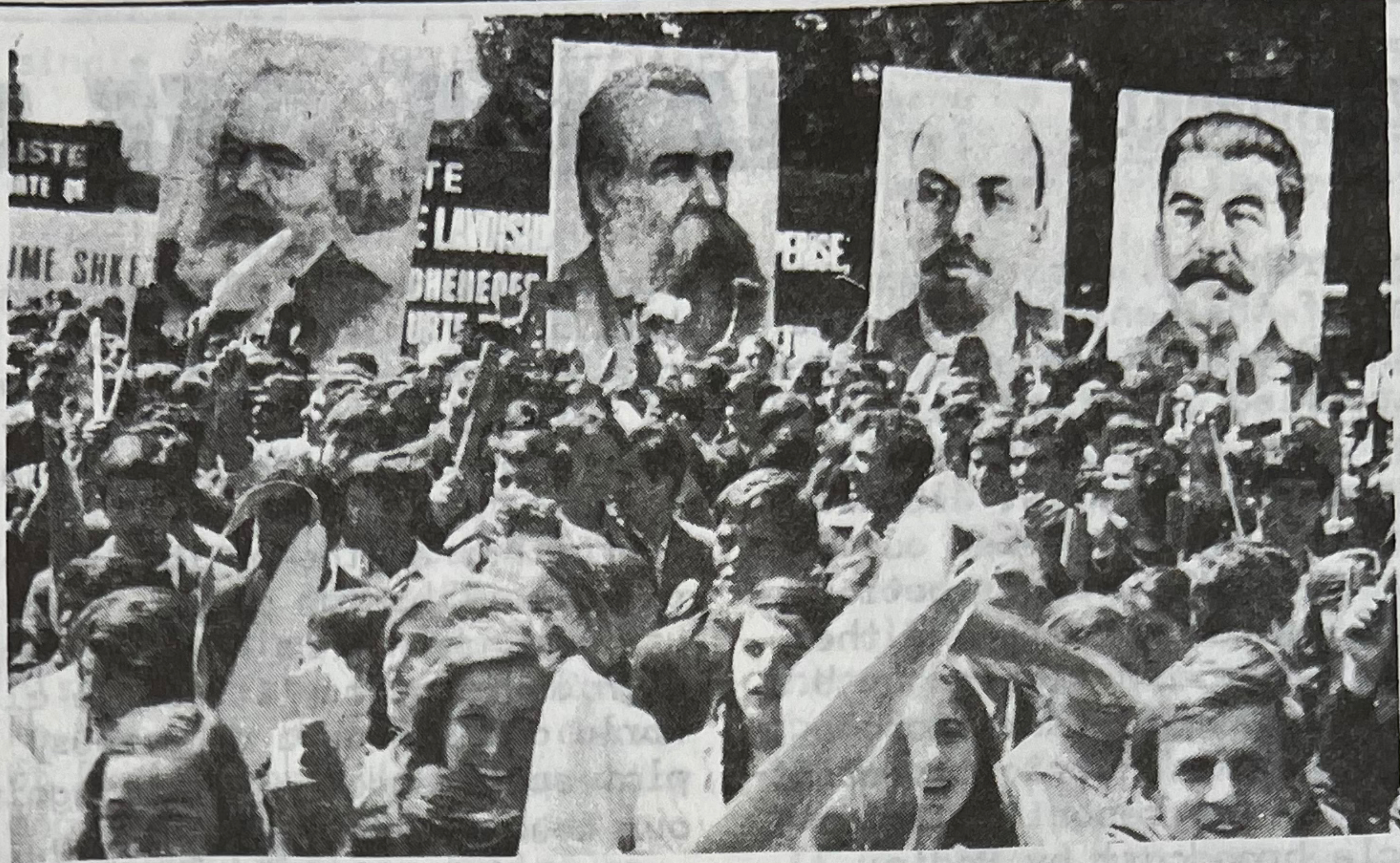
MAY DAY IN PEOPLE'S SOCIALIST REPUBLIC OF ALBANIA

It is in this context that the watchword of James Connolly, the great patriotic martyr and militant organiser of the Irish working class, must be our watch-