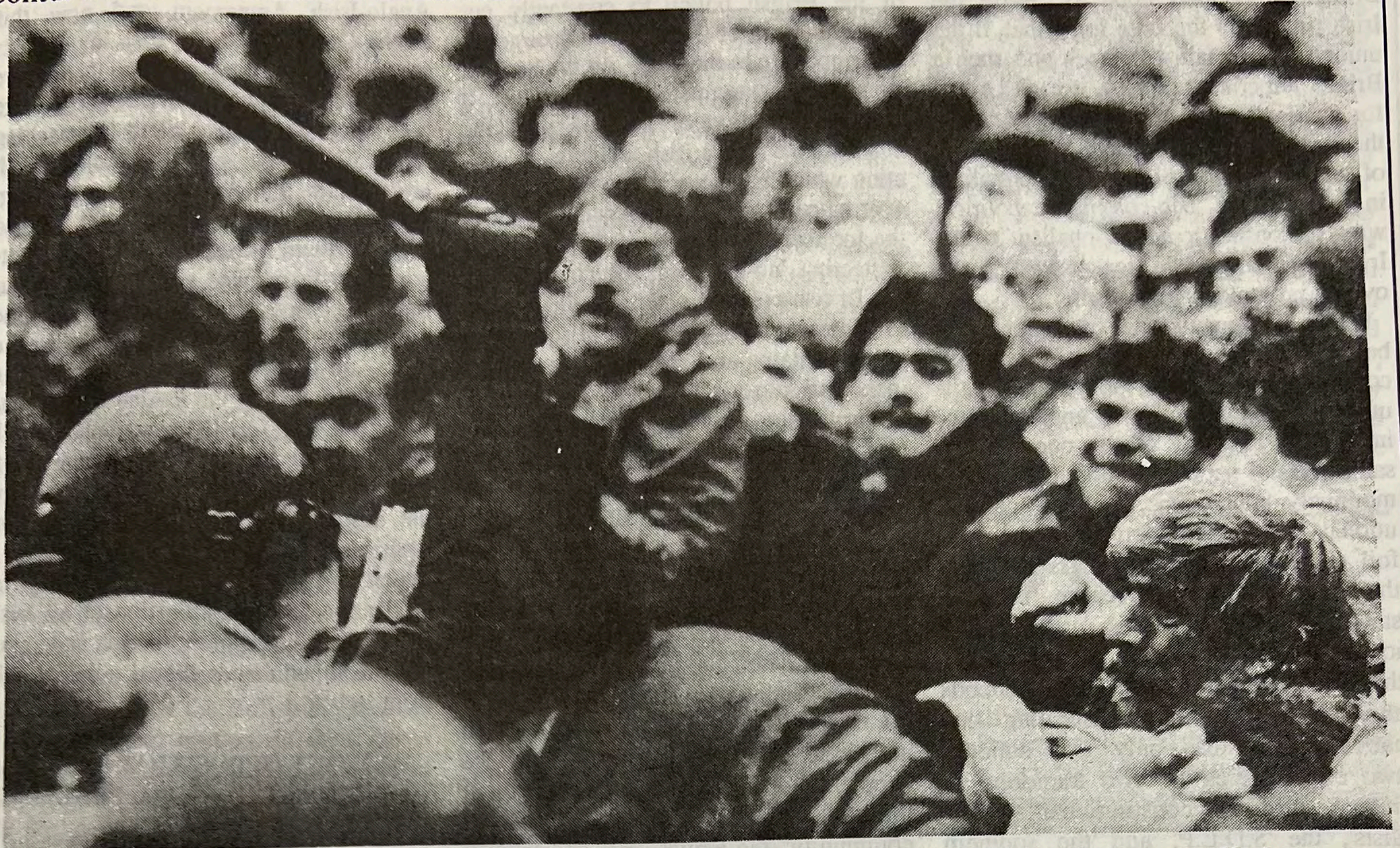
The fascist RUC backed by the British Army violently disrupt the funeral of patriotic martyr Laurence Marley

deceptions being organised by British imperialism once again at this time, just as in the case of the overall British imperialist offensive being waged under the Anglo-Irish Agreement of which this new Public Order Act is itself a product, is the 'unionists' protests against the Public Order Act'. For by this means the fascists Paisley and Molyneaux and their alleged struggle in defence of 'free speech' and the 'right to protest', and 'opposition to Westminster diktat' are doing Trojan work for the success of the British imperialists' policy by making it appear as if the Public Order Act actually does adversely affect unionism, thereby giving credibility to the British imperialists' claim that their role in Ireland really is 'impartial', that they are 'sincerely interested in ending the sense of alienation amongst the nationalist community in Northern Ireland, guaranteeing the democratic rights of nationalists' etc.etc.