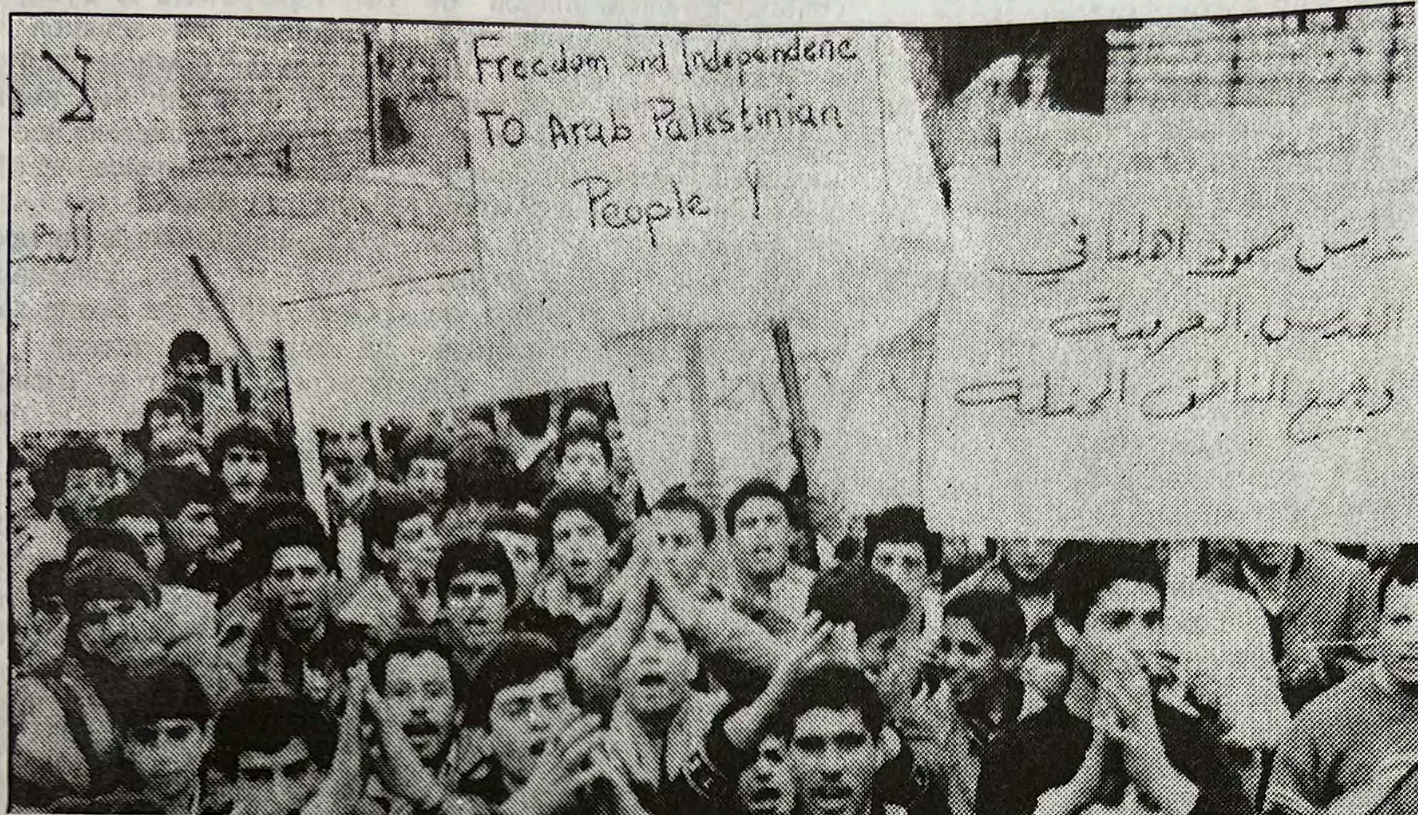
Palestinian and Arab people protest in Nazareth on the West Bank, last year against Israeli occupation and the savage repression of the people

homeland. Israeli Zionism became the principle tool of U.S. imperialism which exerted its domination over the Middle East to ensure its control and plunder of the crucial oil supplies of the Arab countries. The U.S. has backed Israel economically and politically as well as with billions of dollars of military aid. Through successive expansionist wars in 1956, 1967 and 1973, and again with the invasion of Lebanon in 1982, the Israeli Zionists seized new tracts of Arab land, committed new atrocities against the Palestinians and with the assistance of Arab reaction,