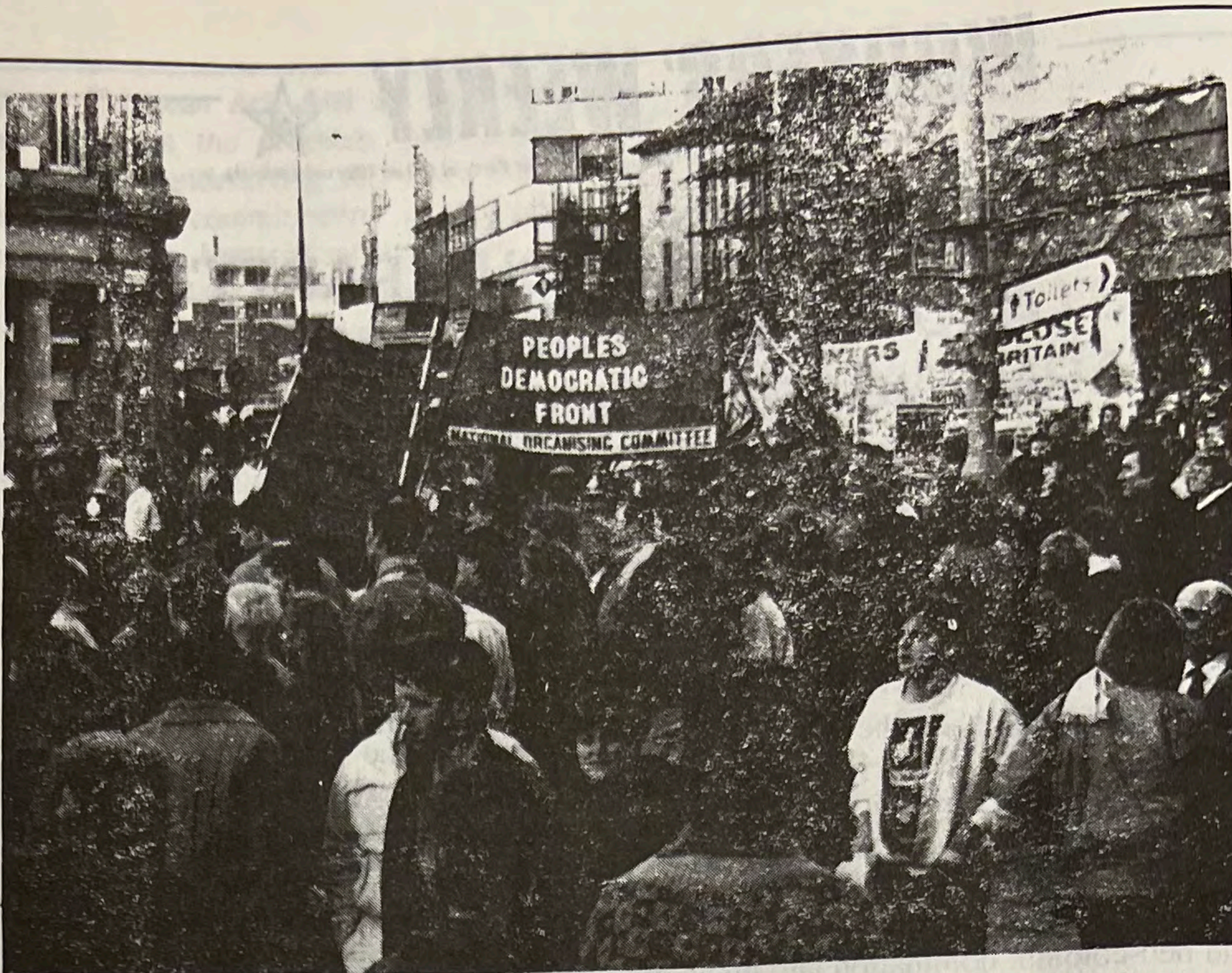
PHOTOGRAPH SHOWS 3,000 STRONG DEMONSTRATION IN SHEFFIELD IN FEBRUARY ON THE 15th ANNIVERSARY OF BLOODY SUNDAY

Whilst pursuing the same policy on Ireland, Labour differs from the Tories in the fact that it presents itself as having a different long-term aspiration. Thus for